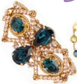
Statement bracelet, £280, Otazu