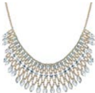
Gold diamanté crystal collar necklace, £40 , Jon Richard