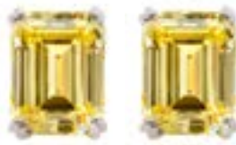
Topaz earrings, £199 , Carat London

Coloured necklaces of all shapes and sizes are a winner, too. The only question is, will you opt for a sultry sapphire shade, an elegant amethyst or an unusual yellow topaz? The choice is yours!