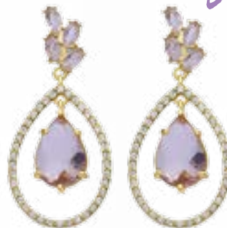
Purple stone earrings, £45 , Jenny Packham