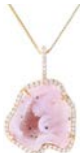
Pink stone necklace, £2500 , Karolin Studio