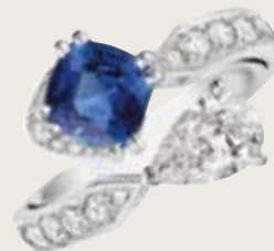
Sapphire and diamond ring, POA , Chaumet