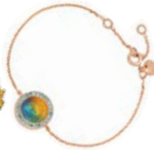
Agate and apatite bracelet, £185, Lola Rose