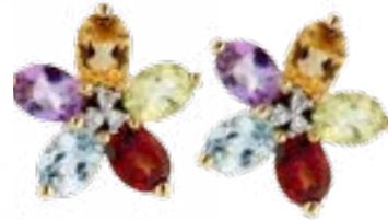
Yellow gold flower earrings, £250 , Ernest Jones