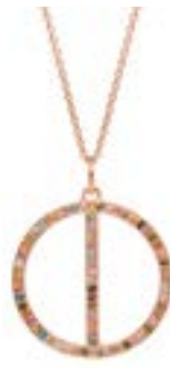
Mixed tourmaline necklace, from £395 , Lola Rose