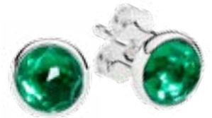
Emerald green stud earrings, £40 , Pandora