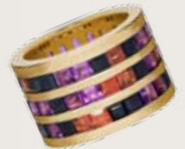
Multi-stone banded ring, £11,000 , Tessa Packard London