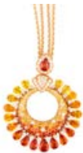
Multicoloured sapphire and diamond pendant, £8995 , Sifani