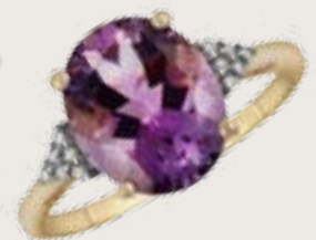
Amethyst ring, £143 , Gemporia