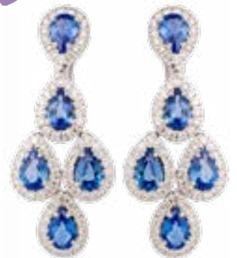
Diamond and blue sapphire earrings, £6500 , Sifani