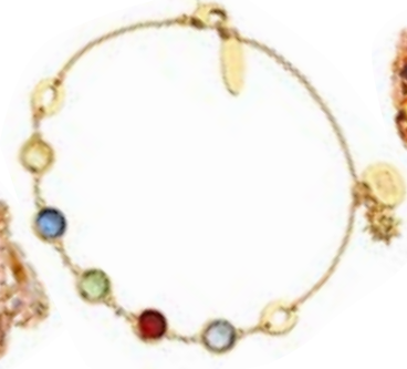
Multicoloured-stone bracelet, £34, Newbridge Silverware