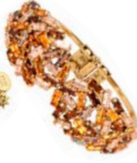
Amber bracelet, £300, Otazu