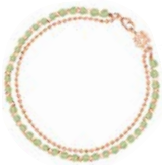
Rose gold and peridot bracelet, £98, Dower & Hall