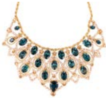
Statement necklace, £515 , Otazu