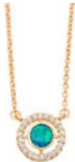
Opal necklace, £750 , Astley Clarke