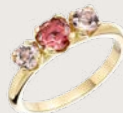
Pink tourmaline and morganite ring, £1100 , Winterson