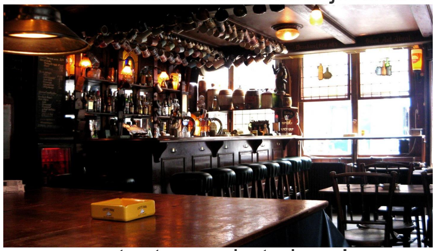
get a team photo here!