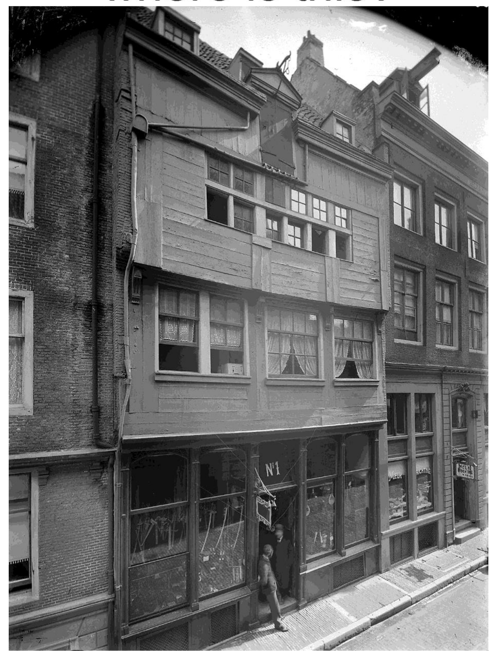
get a team photo here