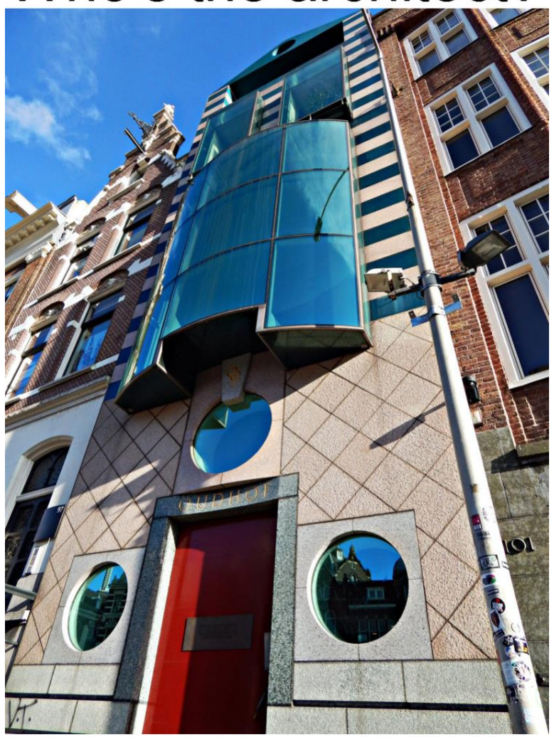
can you find this building?