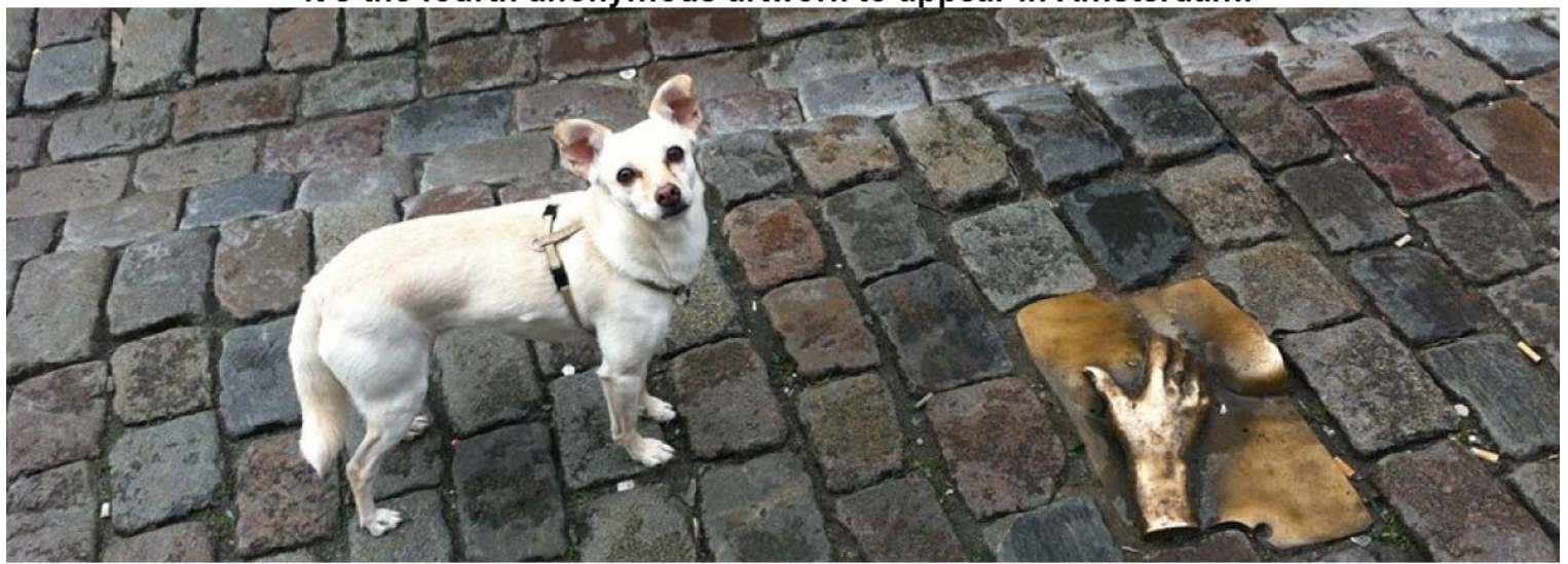
Where is it? (No extra points for dog)

This titillating feature was caressed into existence in late February 1993. It's the fourth anonymous artwork to appear in Amsterdam.