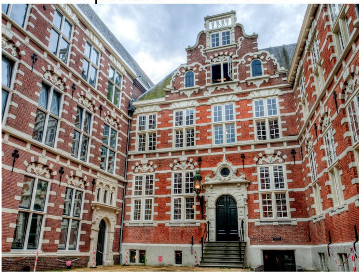
Can you get a team picture in the courtyard?

this building was once really important for the VOC