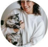
Persona 1 Juliet