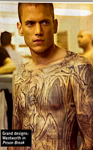
Grand designs: Wentworth in Prison Break

I ask whether there's a downside to being in a hit show. "Well there was the tattoo," he laughs, referring to his character's enormous, torso-covering ink stain which hides the blueprints of the prison he's breaking out of. "It took four hours to apply and became a bit of a burden. My skin was caked in this blue gunk; it was horrible." What about the attention he gets? Even during this interview, fan mail has been pouring into his hotel suite. "The mail amazes me – I sometimes