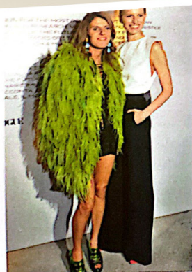
▲ Milan, September 2010: at an after-show party with model Karolina Kurkova