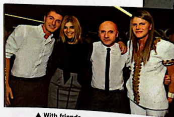
▲ With friends Stefano Gabbana, Carine Roitfeld and Domenico Dolce backstage at the Dolce & Gabbana spring/summer 2009 show, Milan