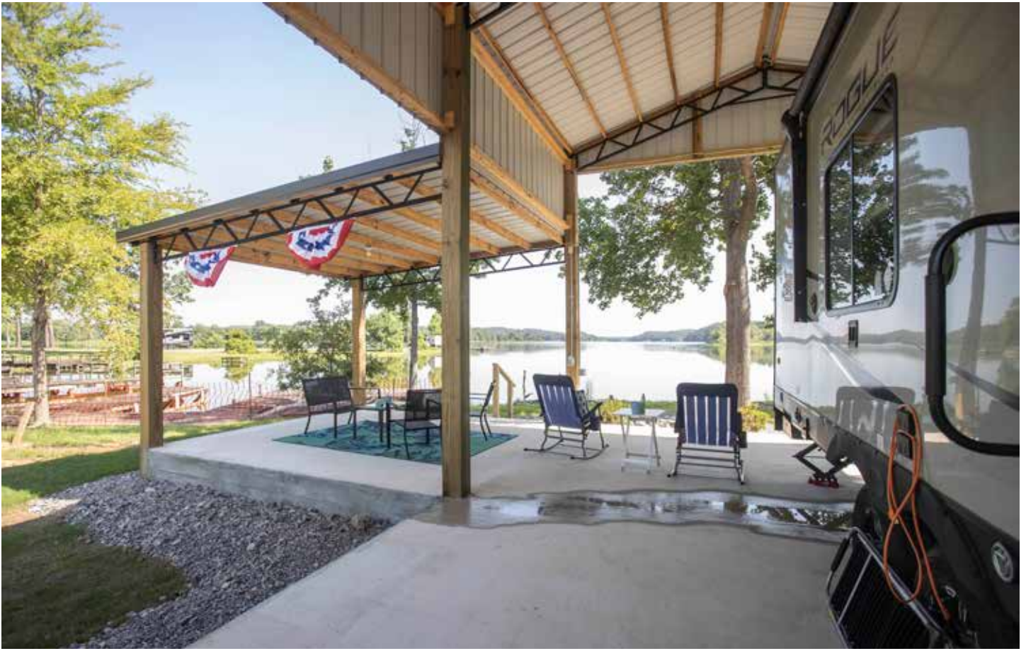
A view of Logan Martin Lake from Angler's Pointe.