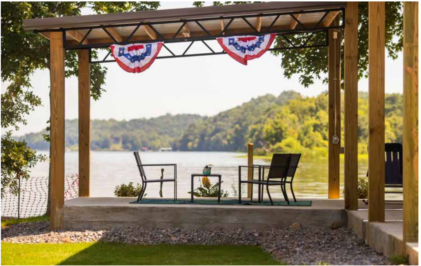
Angler's Pointe offers a variety of waterfront vistas.