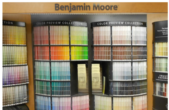
Benjamin Moore Paint