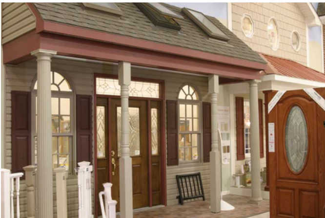
Doors, Windows & Trim