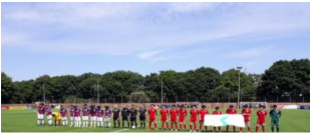
ConIFA WFC: Tibet 1-1 United Koreans In Japan (1-4 on pens) @ St. Paul's Sports Ground, Rotherhithe