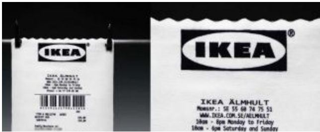
Ikea reveals rug that looks like a giant receipt