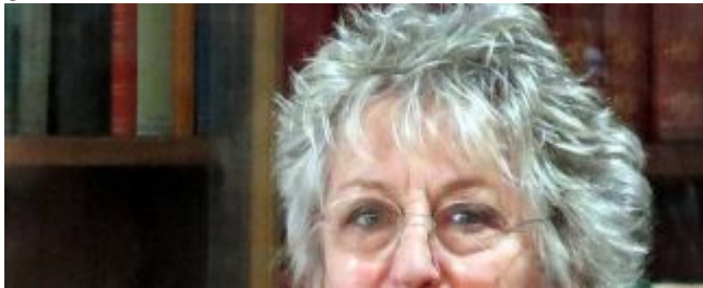
Germaine Greer: from feminist firebrand to professional troll