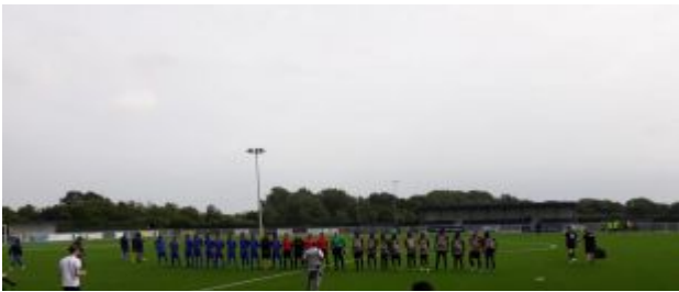
ConIFA WFC: Chagos Islands 0-1 Matabeleland @ Parkside, Aveley