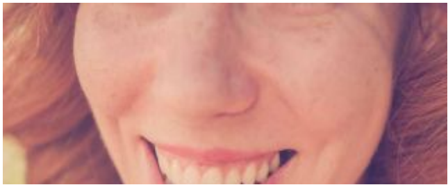
A jelly-eating book-reading train commuter was living her best life