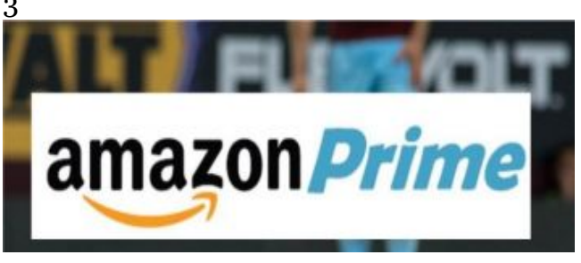
<u>Amazon secures rights to broadcast 20</u> <u>Jurassic World review - the dumbest</u> Premier League games from 2019/2020