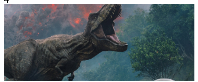
movie ever made