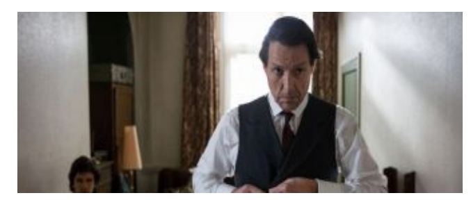
TV Review: A Very English Scandal