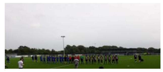
ConIFA WFC: Chagos Islands 0-1 Matabeleland @ Parkside, Aveley