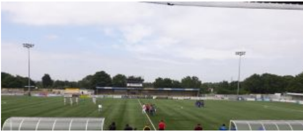
ConIFA WFC: The main stories from the quarter-finals and first placement round