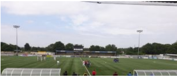
ConIFA WFC Quarter-Final: Barawa 0-8 Northern Cyprus @ Gander Green Lane, Sutton