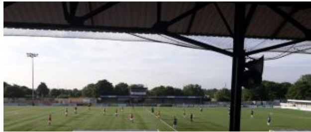
ConIFA WFC Quarter-Final: Karpatalja 3-1 Cascadia @ Gander Green Lane, Sutton