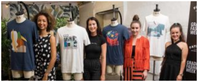
FatFace announces winners of Graduate Fashion Week design competition