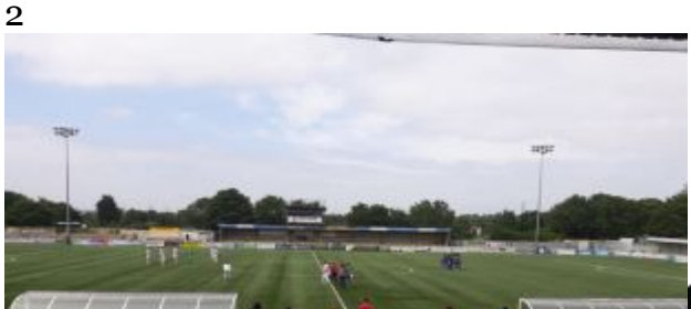
<u>ConIFA WFC Quarter-Final: Baraw</u> <u>8 Northern Cyprus @ Gander Green</u> <u>Lane, Sutton</u>

<u>ConIFA WFC Quarter-Final:</u> <u>Karpatalja 3-1 Cascadia @ Gander</u> <u>Green Lane, Sutton</u>