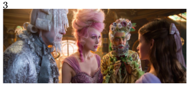
Lego Movie 2, Bumblebee, Wreck it Ralph 2 and The Nutcracker trailers all land