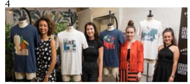
FatFace announces winners of Graduate Fashion Week design competition