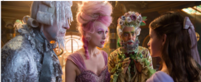
Lego Movie 2, Bumblebee, Wreck it Ralph 2 and The Nutcracker trailers all land