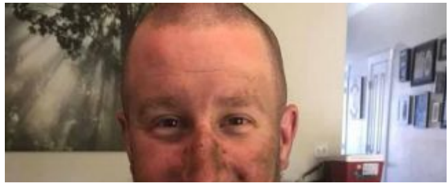
This guy's dirty face served up a life lesson for a mother and daughter