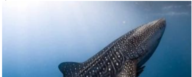
How Madagascar became a haven for whale sharks