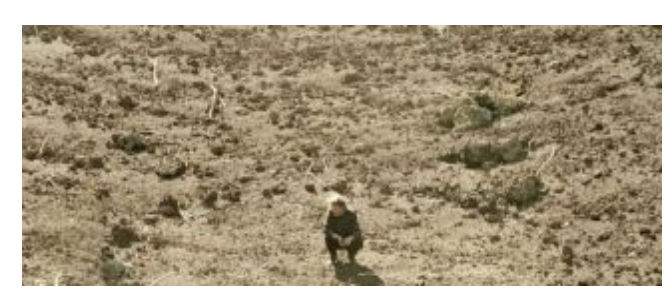
Album review: Ben Howard - Noonday Dream