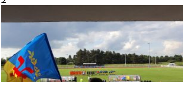
ConIFA WFC: Western Armenia 4-0 Kabylia @ Queen Elizabeth II, Enfield