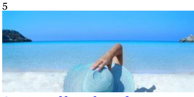
<u>Get Yourself Beach Ready</u>