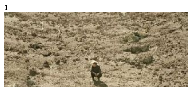
<u>Album review: Ben Howard - Noonday</u> <u>Dream</u>