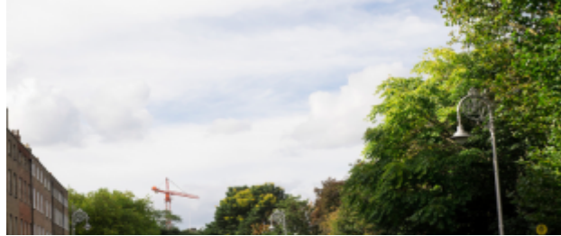
It's A Yes: Ireland votes to repeal the eighth amendment and legalise abortion