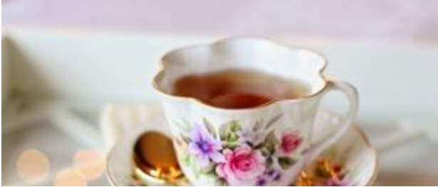
Brits will have to endure 9,828 disappointing cups of tea in their lifetime