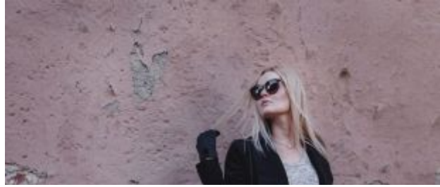
The hottest sunglasses out right now