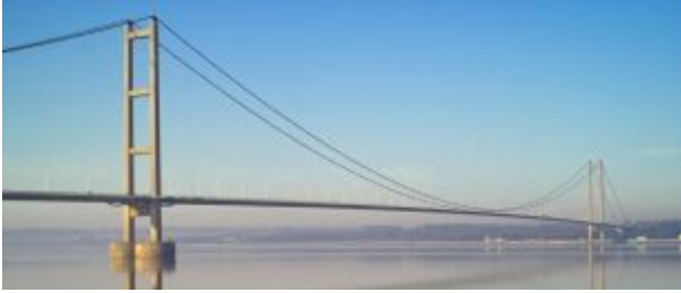
Humber Bridge to see broadcast of poems and positive mental health messages