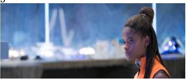
Women scientists are more than capable of leading blockbuster storylines