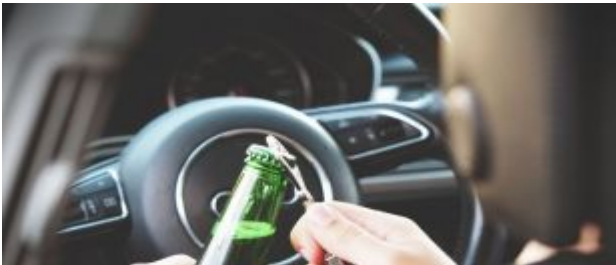
What every student needs to know about drink-driving