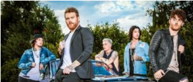
Interview: Asking Alexandria