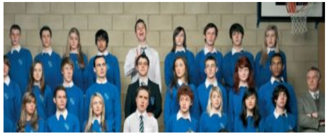
8 TV schools we'd love to have attended