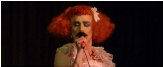
Where the comedy seeds are sown: exploring Exeter's budding arts scene