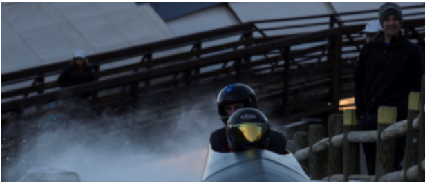
GB Bobsleighers record best finish in 53 years - in a Crowdfunded sled