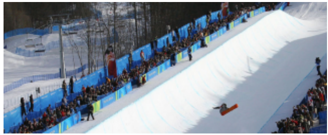
Snowboarder, 18, breaks ankle but still finishes second