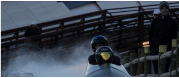
GB Bobsleighers record best finish in 53 years - in a Crowdfunded sled