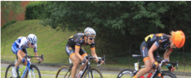
Omloop Het Nieuwsblad women's race stopped as cyclist catches men's event