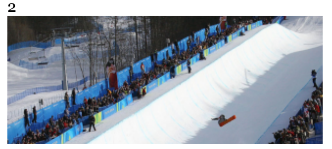
Snowboarder, 18, breaks ankle but still finishes second