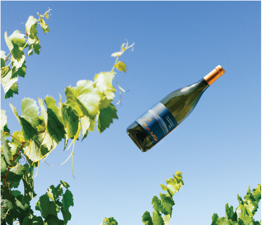
ALMA ROSA WINERY