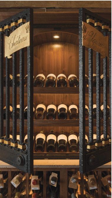
CHATEAU D'YQUEM COLLECTION

San Ysidro Ranch’s world-class wine cellar is reaching celestial heights. The resort has procured 138 vintages from celebrated Bordeaux estate Château d’Yquem, cultivating the most extensive restaurant allocation of its kind in North America. Of the vineyard’s nearly 700-year history as a standard-setter in dessert wine, this Premier Cru Supérieur collection—featuring vintages from 1811 to 2008—is its almost 200-year highlight reel. Its star is the 1811 “Comet Vintage,” mystified by an astronomical alignment during its harvest. Less than 10 bottles remain, once earning them the loftiest price tag of any white wine in the world. You’ll have to taste it to believe it: perhaps through San Ysidro Ranch’s new Ty Warner Wine Collective, a range of customized tastings, consultations, and classes showcasing its otherworldly offerings. sanysidroranch.com