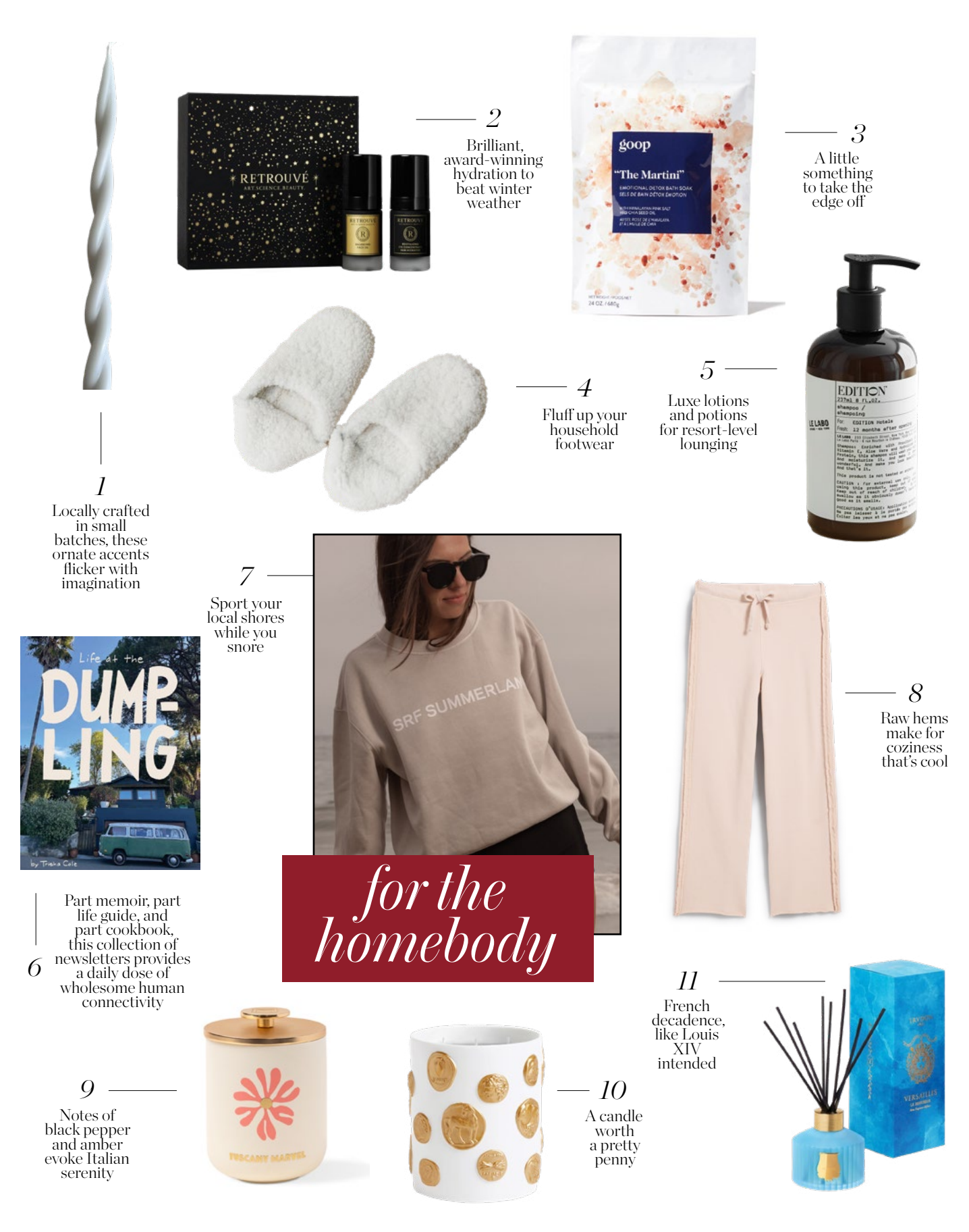
1. 12" Beeswax Twisted Candle, GLŌAM $20. 2. Holiday Harmony Skincare Duo, RETROUVÉ $295. 3. The Martini Emotional Detox Bath Soak, GOOP $40. 4. Shearling Moroccan Slippers, JENNI KAYNE $275. 5. Bath & Body Set, LE LABO X EDITION HOTELS $231. 6. Life at the Dumpling By Trisha Cole, DOMECIL $40. 7. SRF Summerland Crewneck, HEIDI MERRICK $160. 8. Bella Italian Sweatpant, FRANK & EILEEN $238. 9. Tuscany Marvel Travel From Home Candle, ASSOULINE $80. 10. Medaille Candle, L'OBJET $395. 11. Le Diffuseur - Versailles, TRUDON $250.