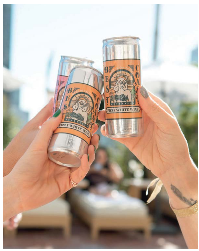
BEST COAST BEVERAGES