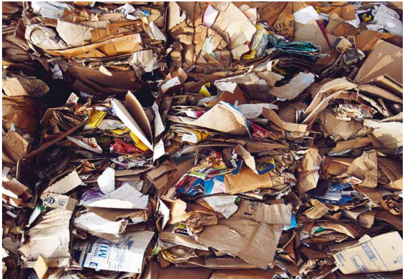
Main © WWF-US / Zachary Bako, inset © Julia Thiemann / WWF