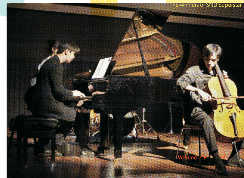
The winners of SNU Superstar

group 1, and this semester I am in group 8. These groups do various activities together, and for certain occasions, all groups do activities together, including the weekly pub, the MT, the Olympics, the Amazing Race, and more. So, there are several layers to the SNU Buddy organization, and aside from being buddies, the Korean buddies also work in one of the four teams which organize the different events.