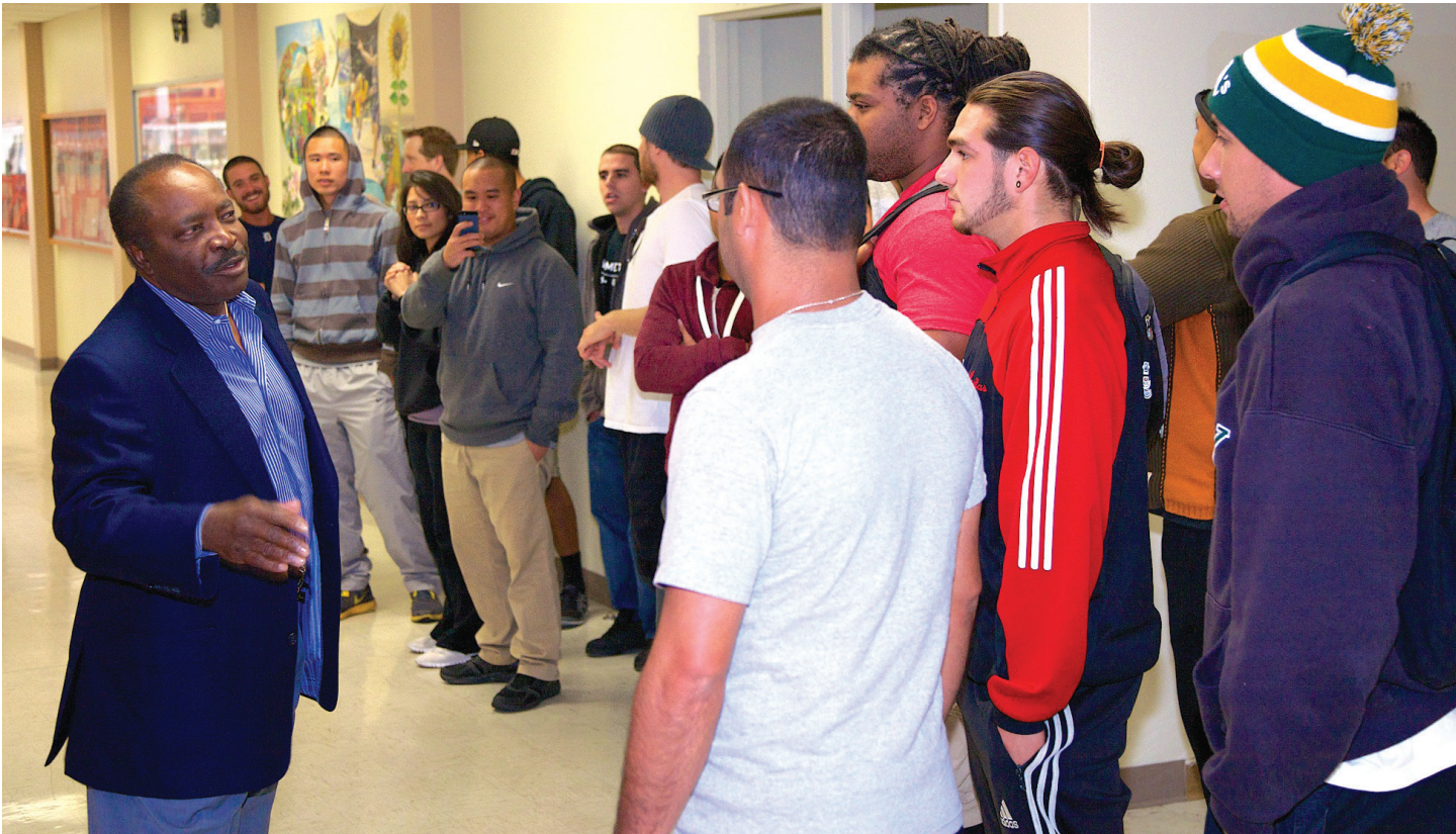
Doe converses with Cal State East Bay students.