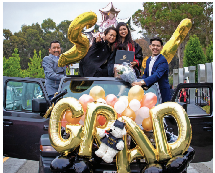
Cal State East Bay celebrated the accomplishments of its 2020 and 2021 graduating classes.

"Earning a degree from Cal State East Bay is life-changing for our students and their entire families," she said. "While we would have loved to honor them with our traditional in-person event ... it was just not yet safe to have a large event in Pioneer Stadium. Our creative solution of a Car-mencement ceremony was so well-received by our graduates and we enjoyed celebrating their achievements in this unique way."