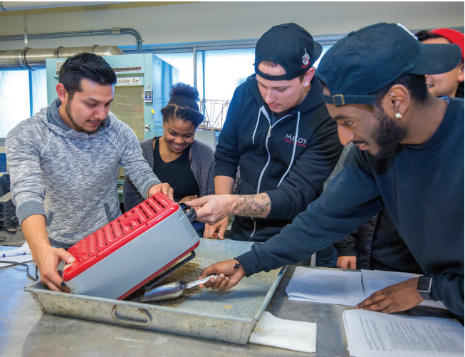
Cal State East Bay Construction Management students work on a project during class.

programs where most of our members work, CEA has built strong partnerships with academic institutions as well as help prepare students for dynamic careers and leadership in the industry.”