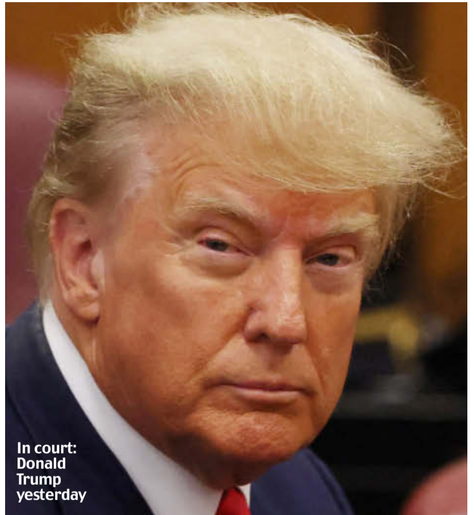
In court: Donald Trump yesterday

Fellow Trump lawyer Joseph Tacopina said that anyone else but his client wouldn't have been charged with such