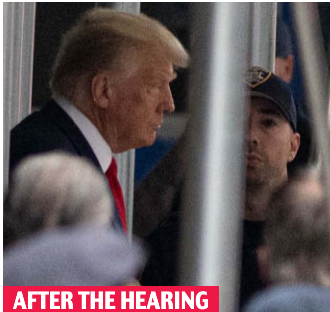
AFTER THE HEARING

Salute to the faithful: Donald Trump raises a fist