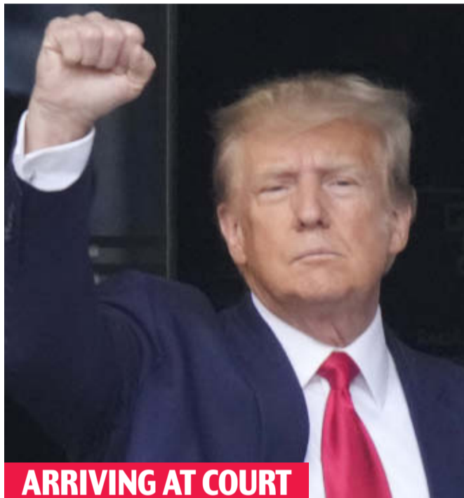
ARRIVING AT COURT