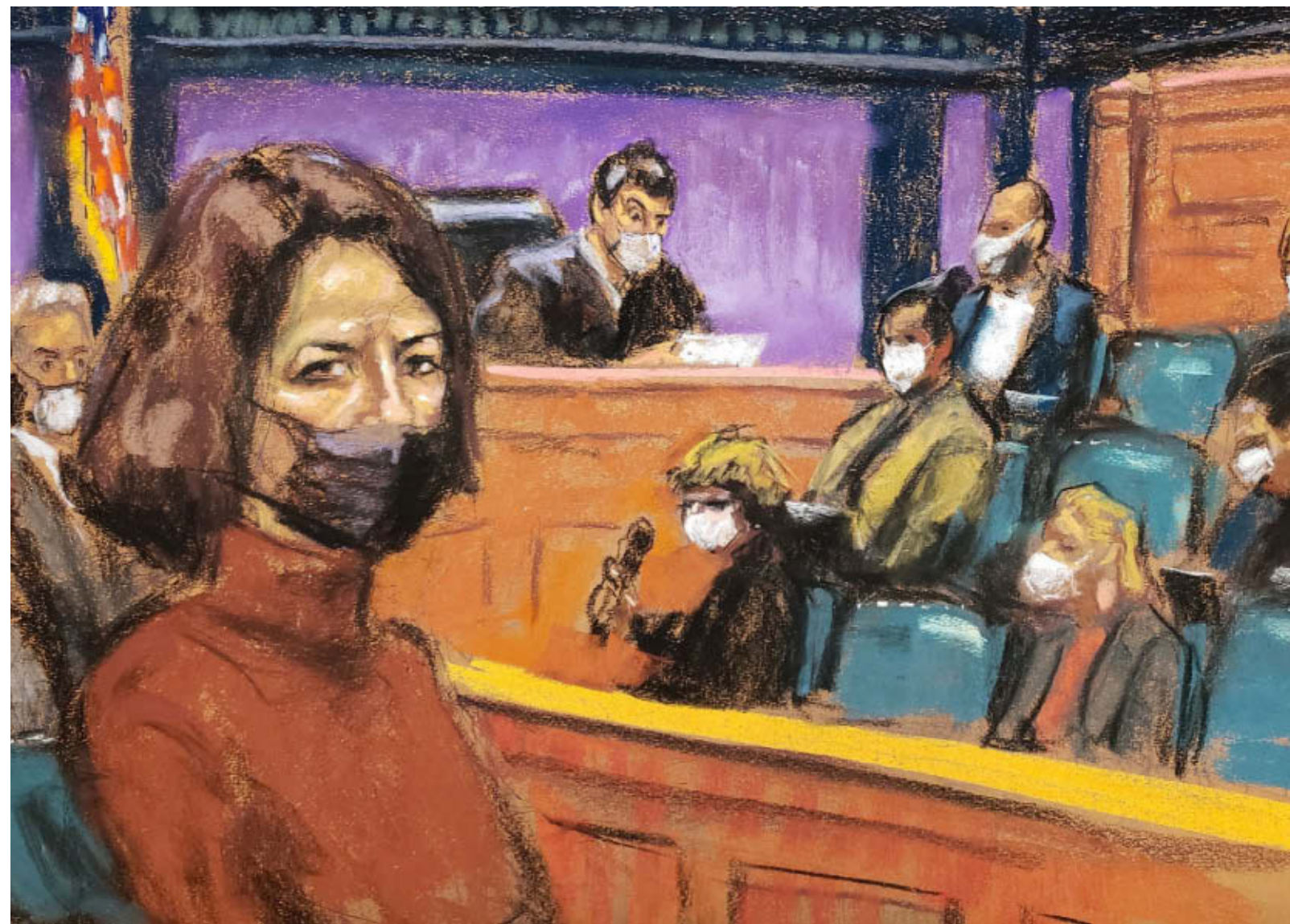
Intense: A sketch of Ghislaine Maxwell staring at the court artist as the guilty verdicts were delivered last night

The jury of six women and six men took just over five days deliberating to seal her fate, finding her