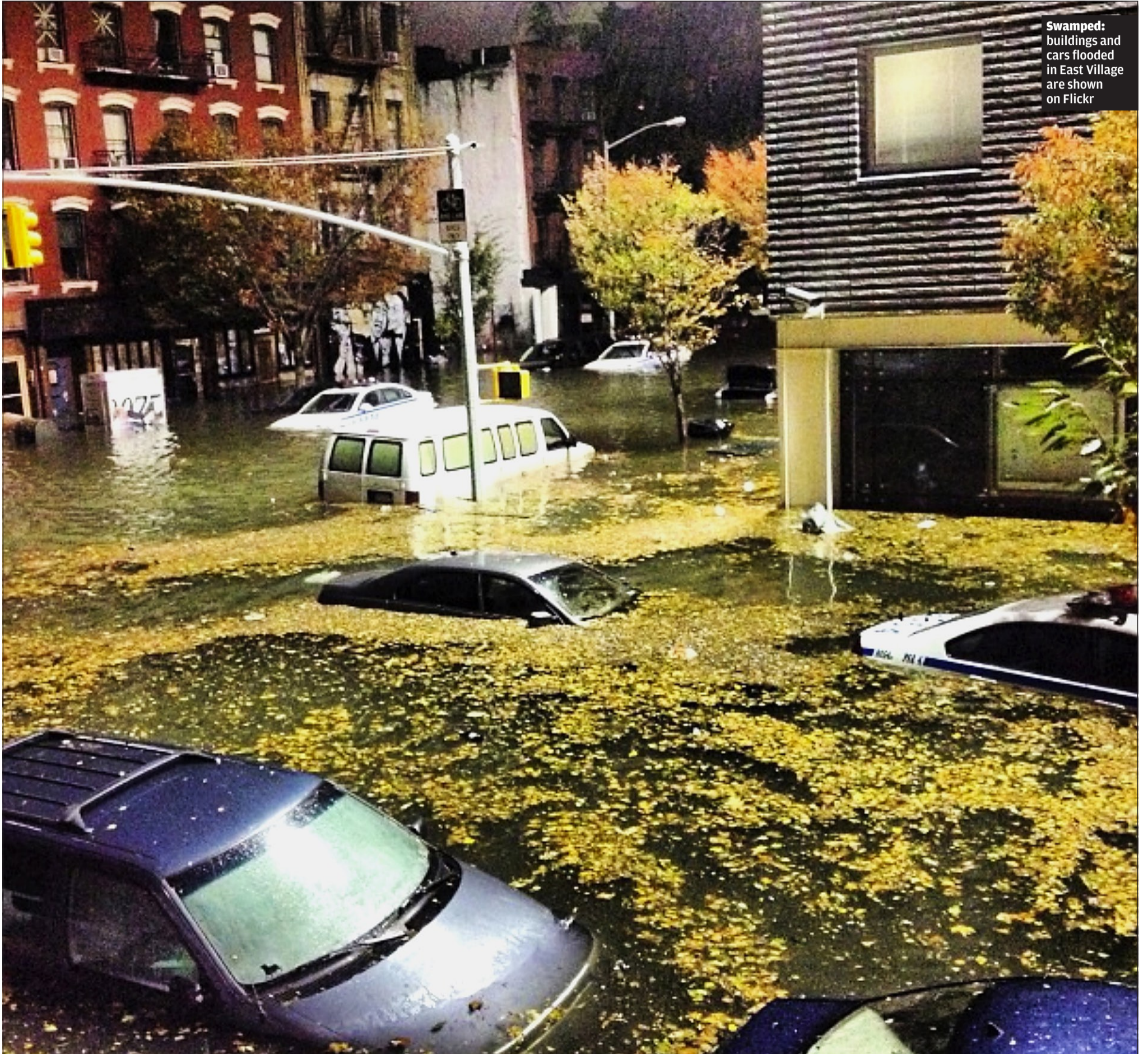
Swamped: buildings and cars flooded in East Village are shown on Flickr