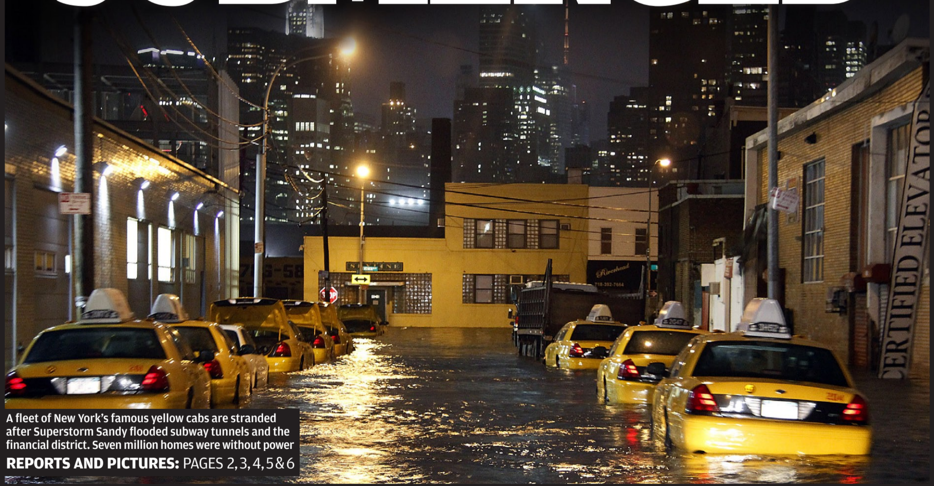
A fleet of New York's famous yellow cabs are stranded after Superstorm Sandy flooded subway tunnels and the financial district. Seven million homes were without power

REPORTS AND PICTURES: PAGES 2, 3, 4, 5 & 6