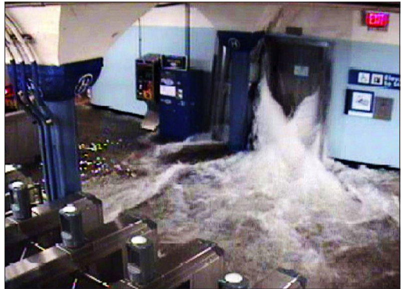
Carnage: water pours through New Jersey station, above, while a fire rages through Queens, below. Ground Zero, bottom, was also awash with storm waters

America's oldest nuclear power station in New Jersey was put on alert after rising flood waters threatened the cool-