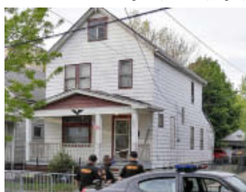
Suburban jail: The kidnapper's house