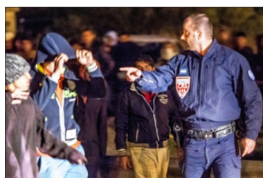
Confrontation: a French policeman warns off migrants trying to reach the tunnel

“The migrants appear every night in large numbers and try to break into the secure zone around the tunnel,” a Calais police source said. “There