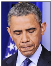
Sombre mood: President Obama talks to the press