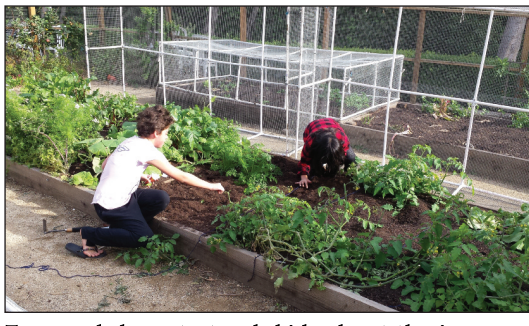
Two workshops to teach kids about the importance of gardening and how to start their own garden will be held on October 22 and October 29.

The gardening workshops offer kids an opportunity to interact and learn what it takes to grow fruits and vegetables and develop their own garden. The workshop