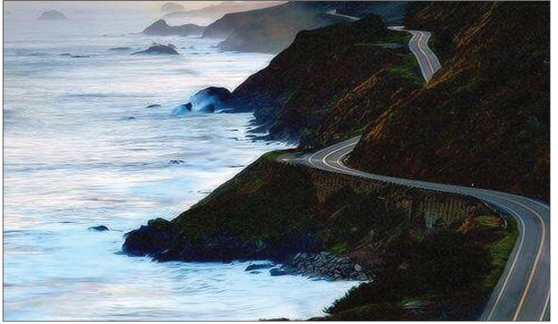
The Santa Monica Police Department are investigating a fatal collision involving a biker that occurred on the PCH on October 15.