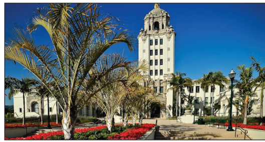
The city of Beverly Hills is sending out rental registry notices to tenants in Beverly Hills.

Council passed a rent stabilization ordinance earlier this year that halts rent increases to 3 percent per year, requires relocation fees for all tenants who are evicted without cause and establishes a rental unit registry