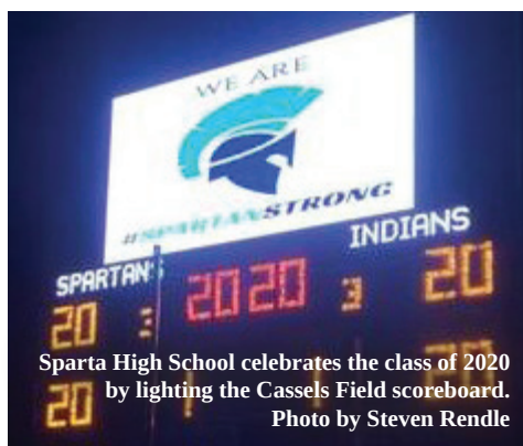
Sparta High School celebrates the class of 2020 by lighting the Cassels Field scoreboard.