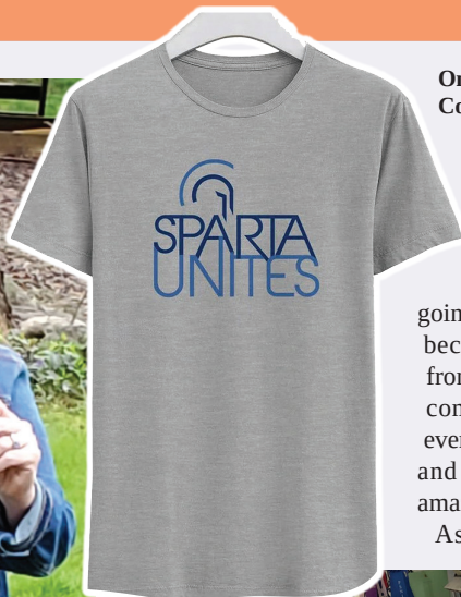
One of the shirts being sold through the SHHH website to benefit SHHH.