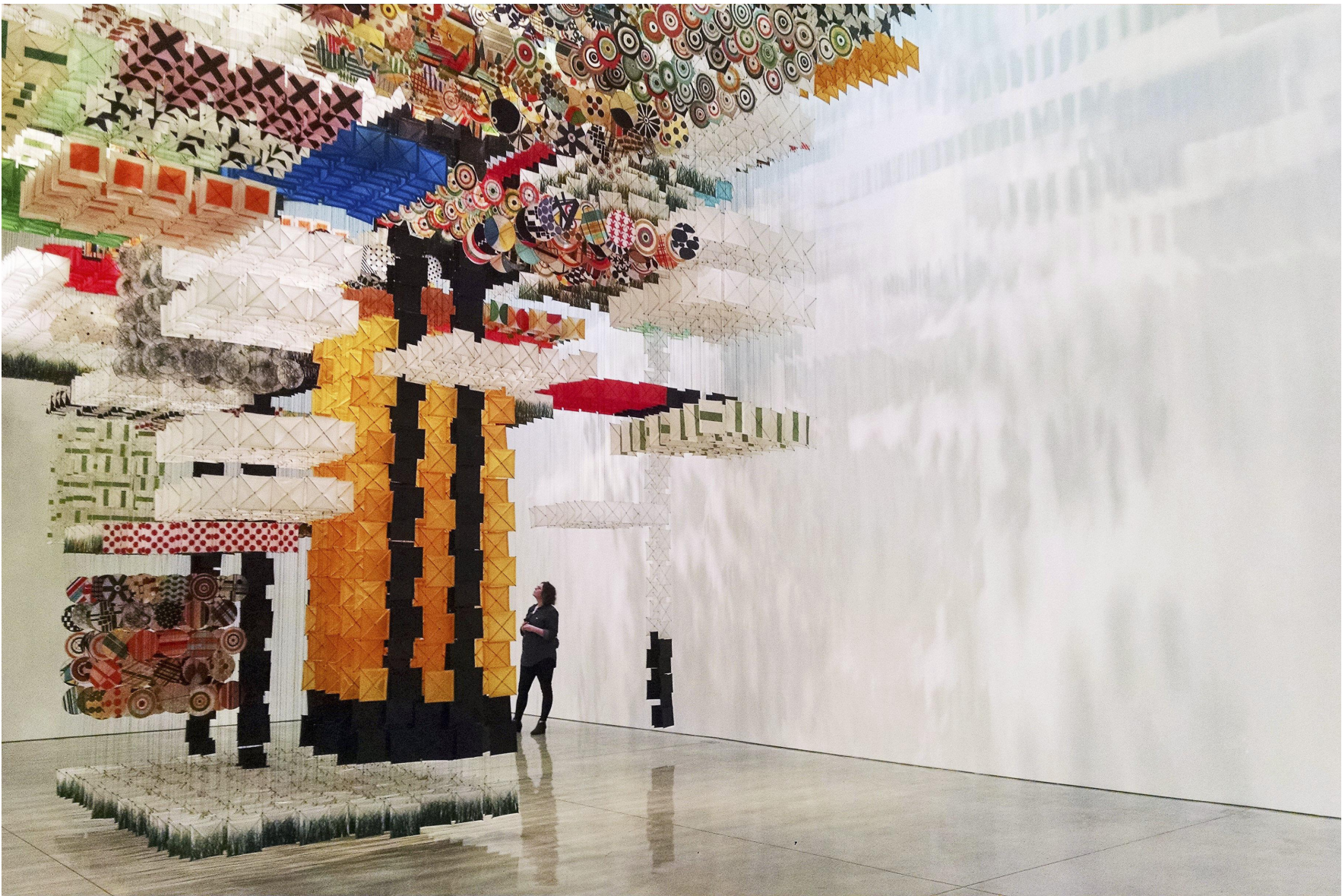
Left and below: an Art Smart tour in NYC; The Metropolitan Museum of Art in New York

► excellent service, it's agreeably grand, and in dating back to the 1920s, when the invention of air-con was making Florida a place to visit rather than avoid, counts as an artistic exhibit in its own right. A four-night Art Concierge package from December 7-10 includes breakfasts and daily private tours with Judy Holm and costs US$30,448 (Dh111,825); biltmorehotel.com.