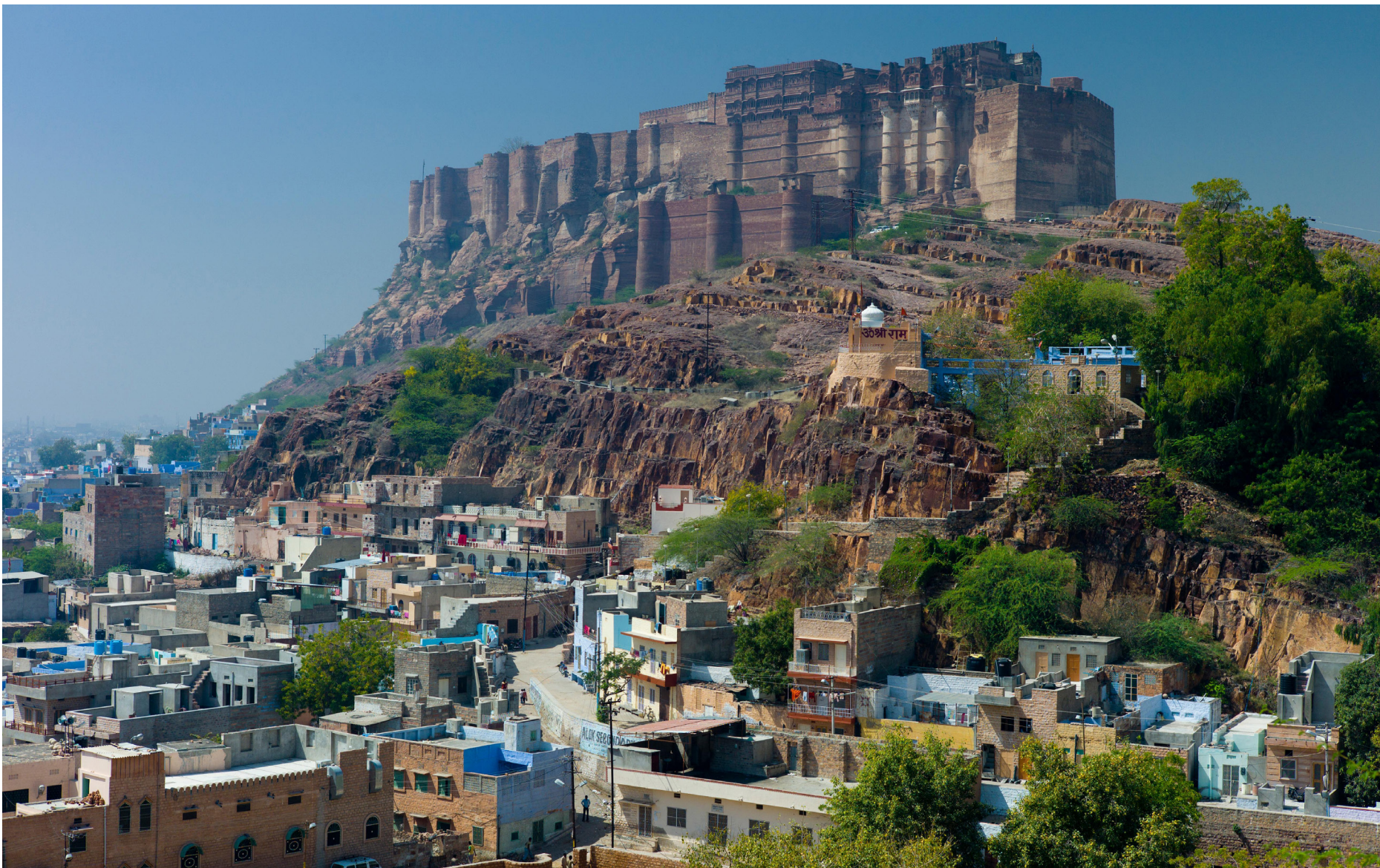
Above, 'Mirrored', at the 2017 Venice Biennale ; right: Mehrangarh Fort in Jodhpur ; left: the Chilean pavilion at the 2017 Venice Biennale