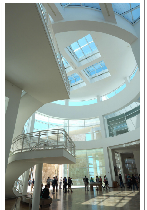
Top, above and left: Musee National Marc Chagall Alamy Stock Photo; The Getty Centre, Los Angeles Arco Images GmbH / Alamy Stock Photo; The National Gallery in London Alamy Stock Photo

10. CICERONI'S ART COLLECTIONS OF LA, NOVEMBER 7-14 Art tours peaked during the 18th century, when every wealthy young thing with any pretence to being cultivated would embark on a Grand Tour of Europe. A ciccone was the knowledgeable person who would accompany them, bringing each site alive. It's that kind of travel that Ciccone Tours aims to recreate. Today LA is firmly on the map of worthwhile stops on a global art tour, thanks largely to the competitive, bottomless-pocketed buying by 20th-century tycoons such as John Paul Getty and Henry Huntington, who aimed to amass collections to rival the great European museums. Cicconi's LA tour focuses on the Getty Centre in LA, devoted to European paintings and sculpture and superb decorative arts, and the Getty Villa in Malibu, designed to resemble the Roman Villa of Papyri at Herculaneum and dedicated to the art of Ancient Greece and Rome. Private visits to houses and gardens in Bel Air and Hollywood and the Huntington gardens in Pasadena are also on the itinerary. Seven nights, staying at the Millennium Biltmore, including some meals