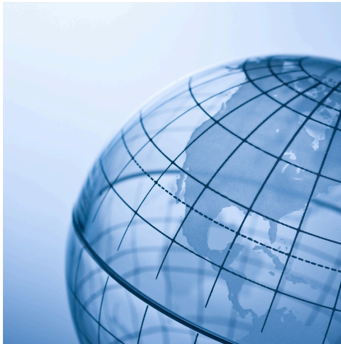
Global Macro Fund