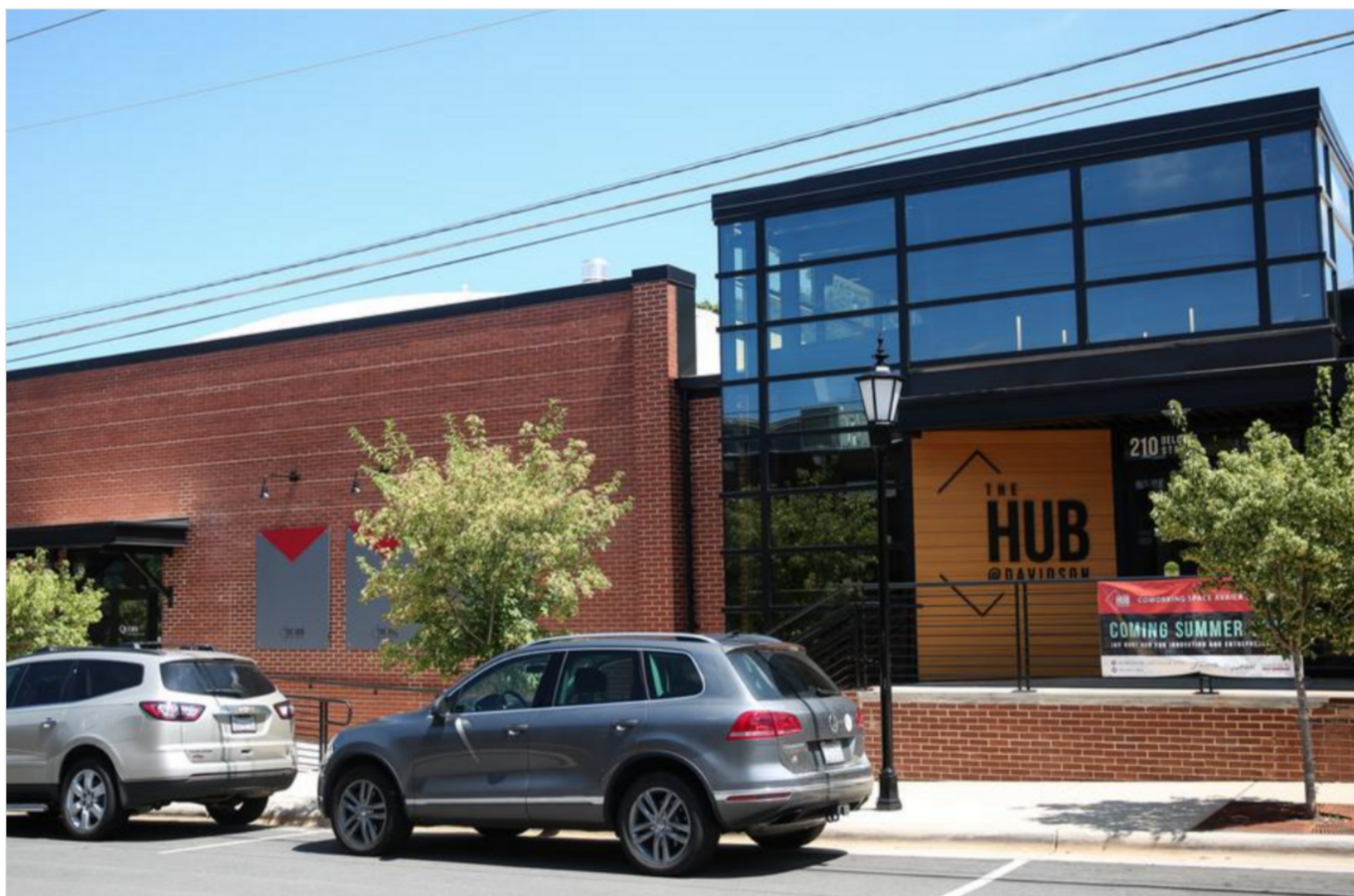
The Hurt Hub@Davidson (College).