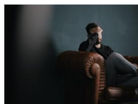
COVID-19 Guide to Mental Health and Wellness