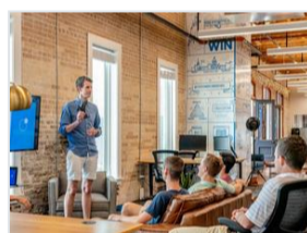
COVID-19 Guide to Leading Employees Through the Crisis