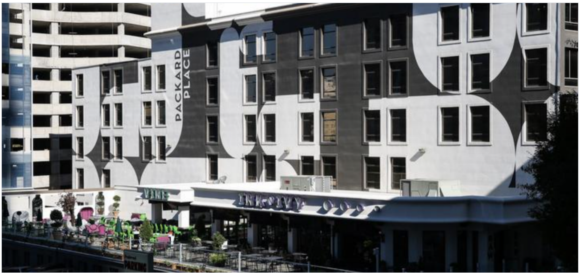
Packard Place, which houses RevTech Capital and Queen City Fintech.