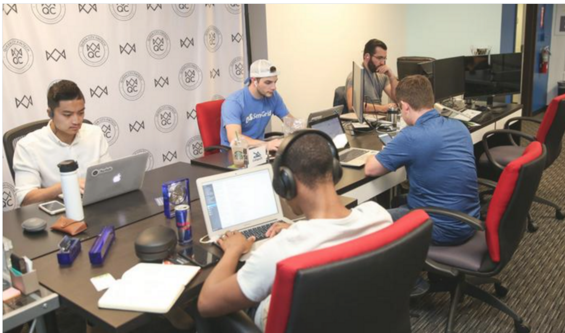
A Queen City Fintech cohort gets down to business.