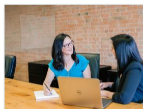
COVID-19 Guide to Mentorship and Support