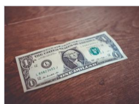
COVID-19 Guide: Money and Funding Resources