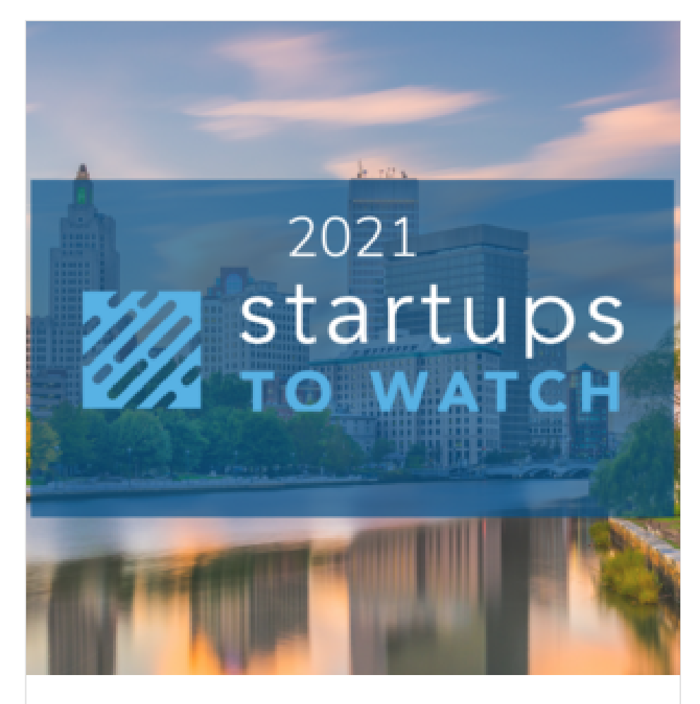
10 Rhode Island Startups to Watch in 2021 See More >