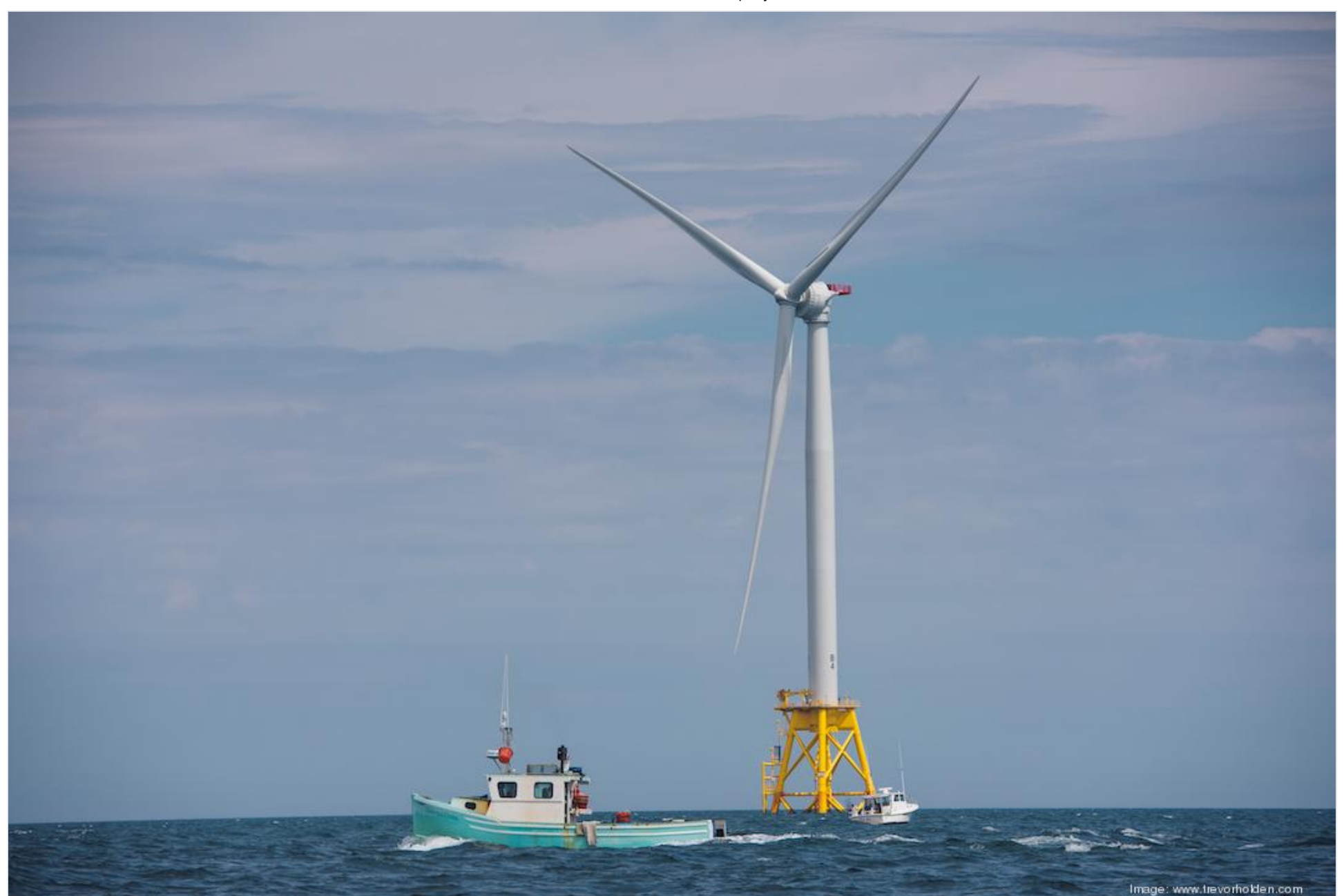
Block Island Wind Farm.

Additionally, the new space will play host to events centered on offshore wind and energy tech, featuring both local and international thought leaders. There are plans for quarterly pitch days and bi-monthly "open door" opportunities for startups, companies and entrepreneurs to engage with the Ørsted team and share their work.