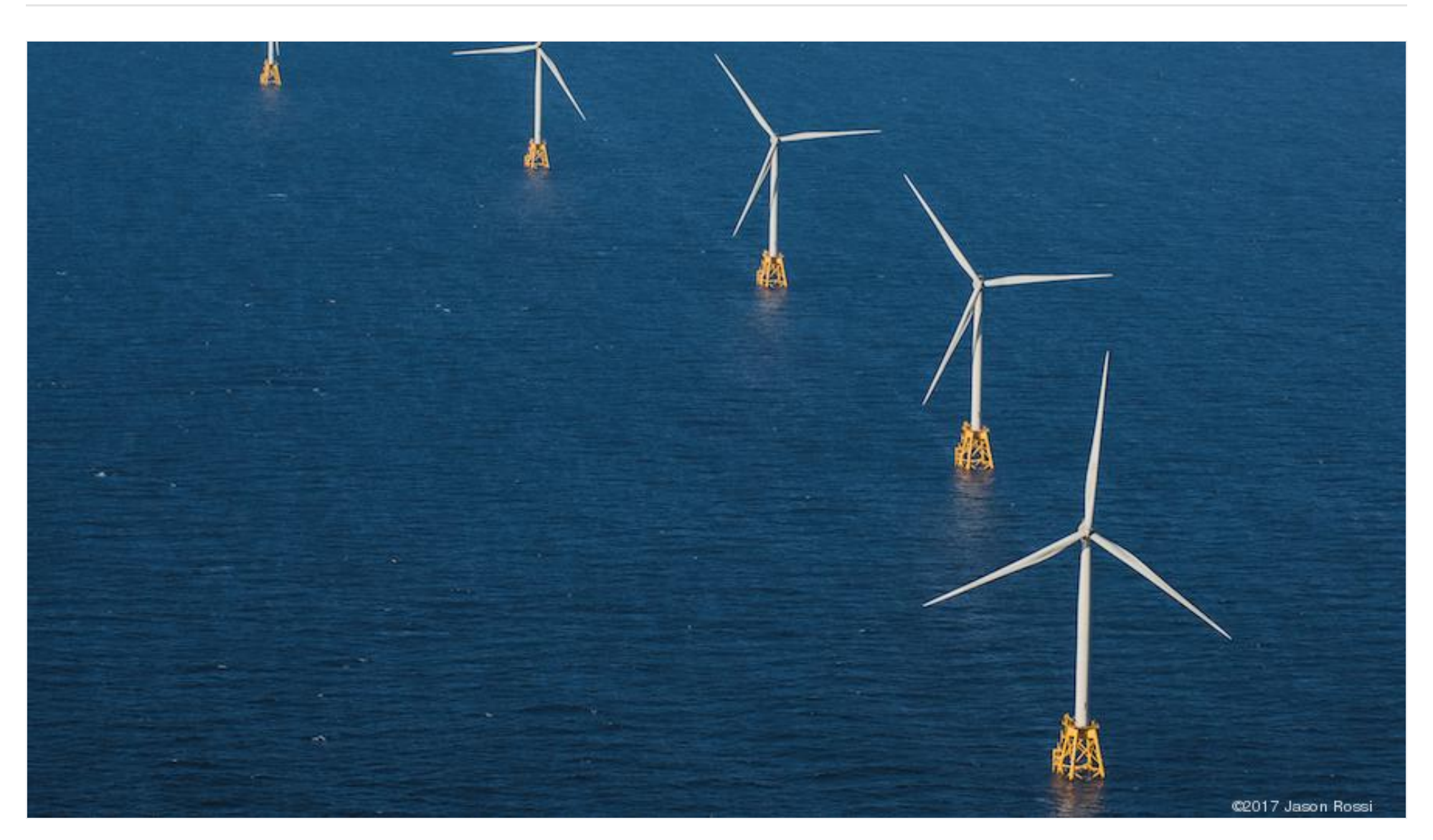
Block Island Wind Farm.