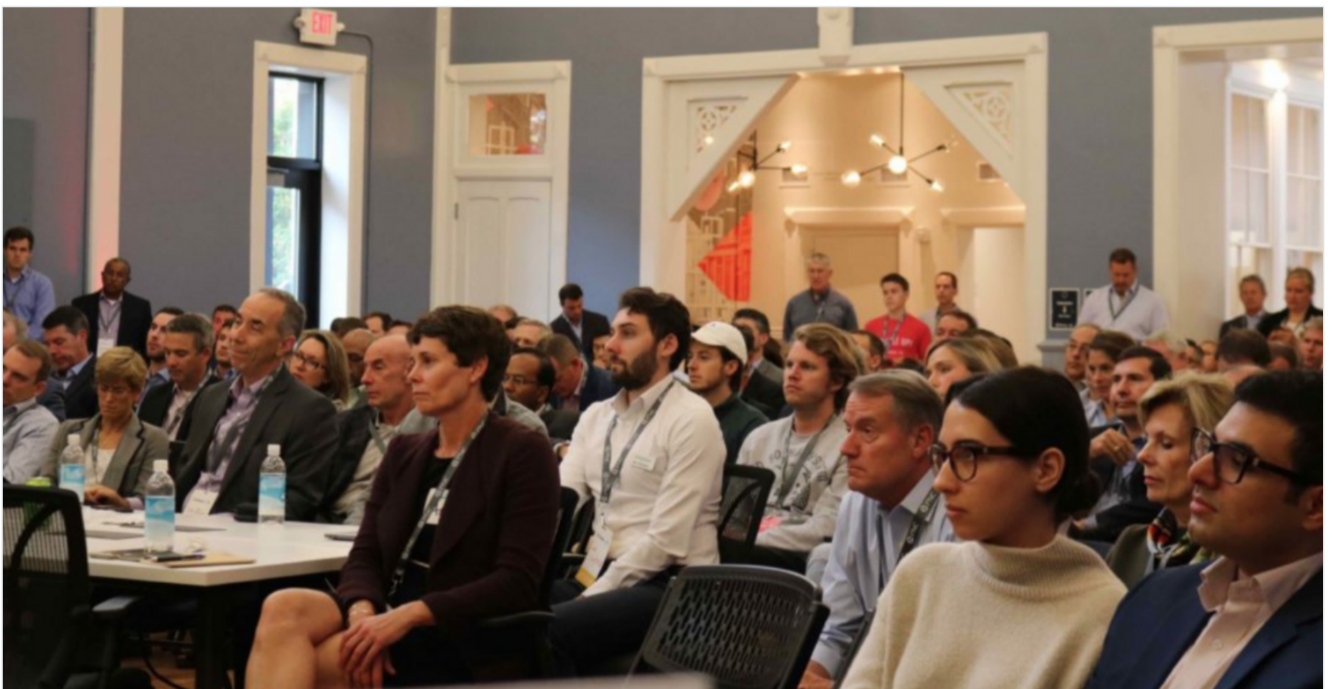
Startup Week Cincinnati.