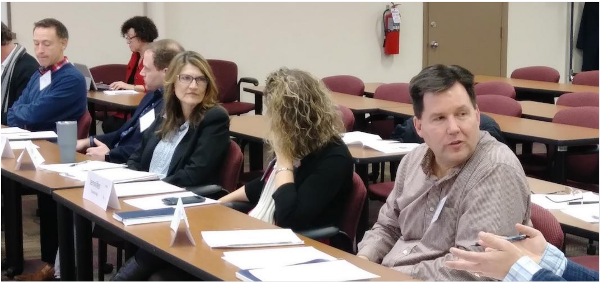
Judges deliberate ahead of student entrepreneur presentations at the Cincinnati Entrepreneurs' Organization Global Student Awards.