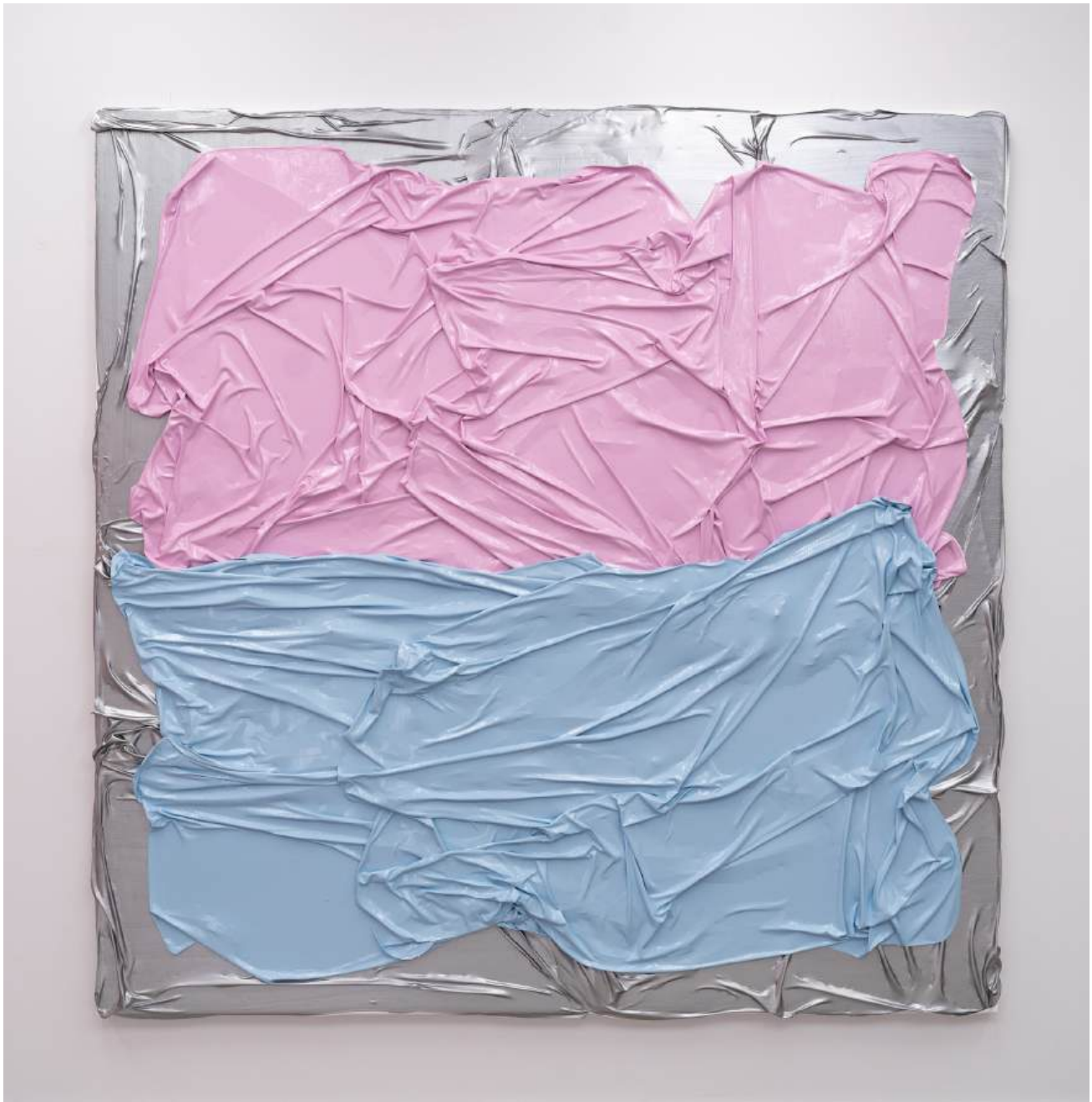
Untitled (SPB), 2024 acrylic on canvas 183 x 183 cm $22,000 incl. GST