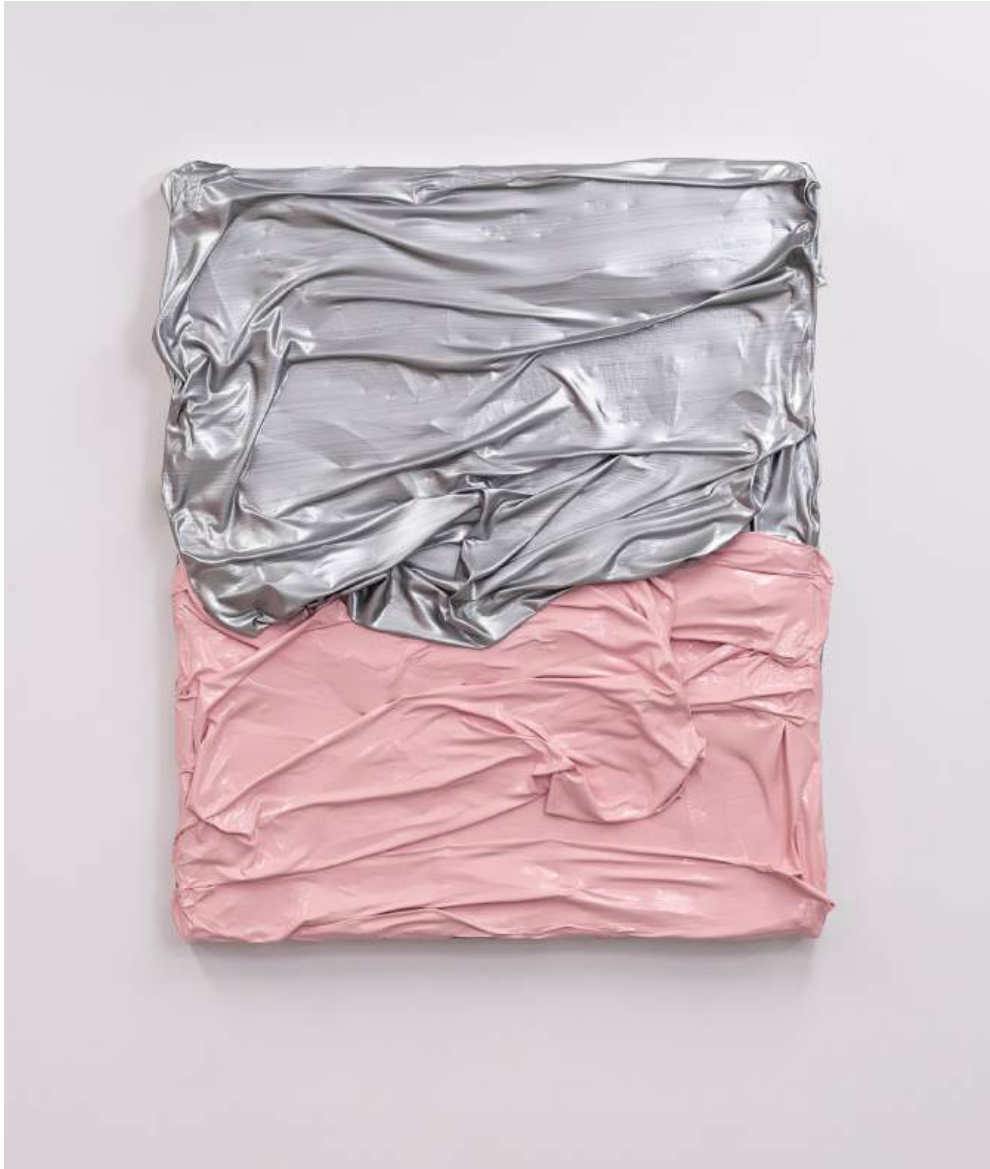
Untitled (SP) , 2024 acrylic on canvas 61 x 51 cm $6,600 incl. GST