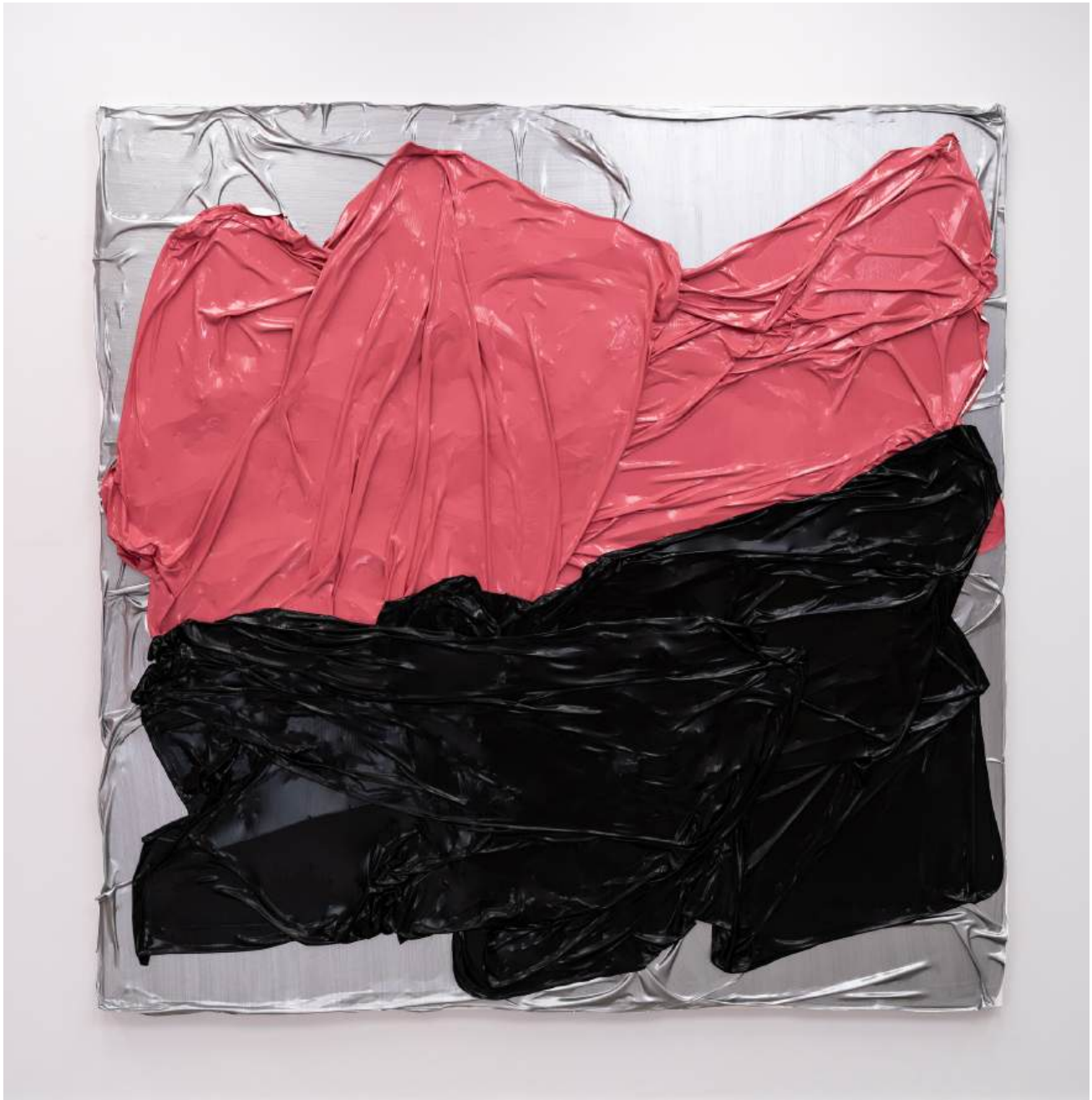
Untitled (SBW) #2, 2024 acrylic on canvas 183 x 183 cm $22,000 incl. GST