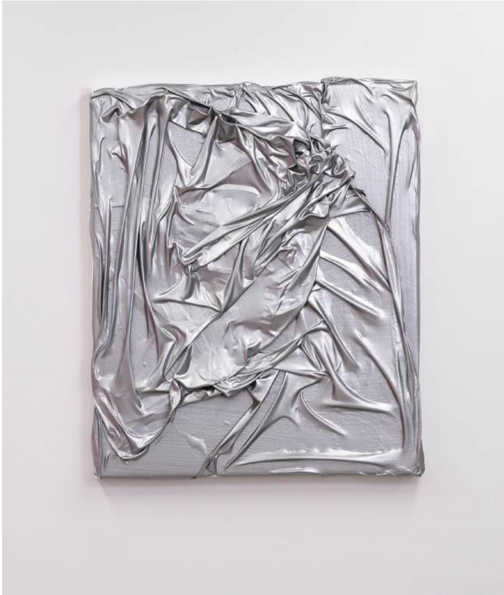
Untitled (Silver) #3, 2024 acrylic on canvas 61 x 51 cm $6,600 incl. GST