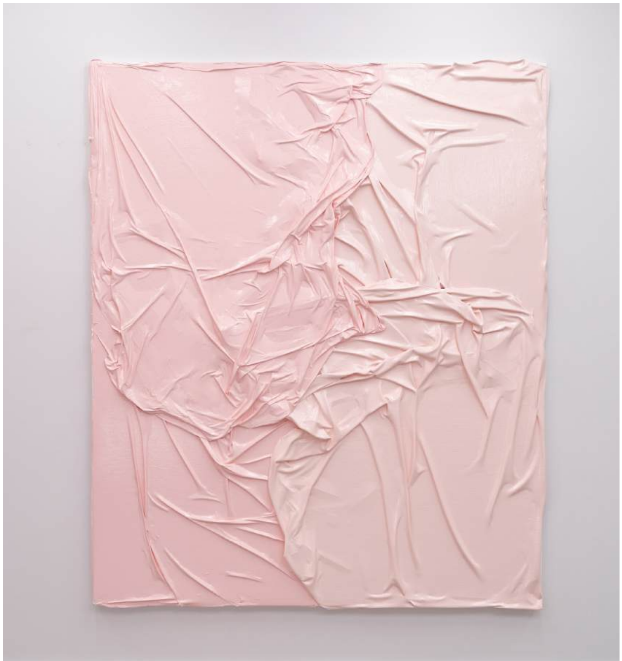
Untitled (PP) #2, 2024 acrylic on canvas 183 x 152 cm $20,000 incl. GST