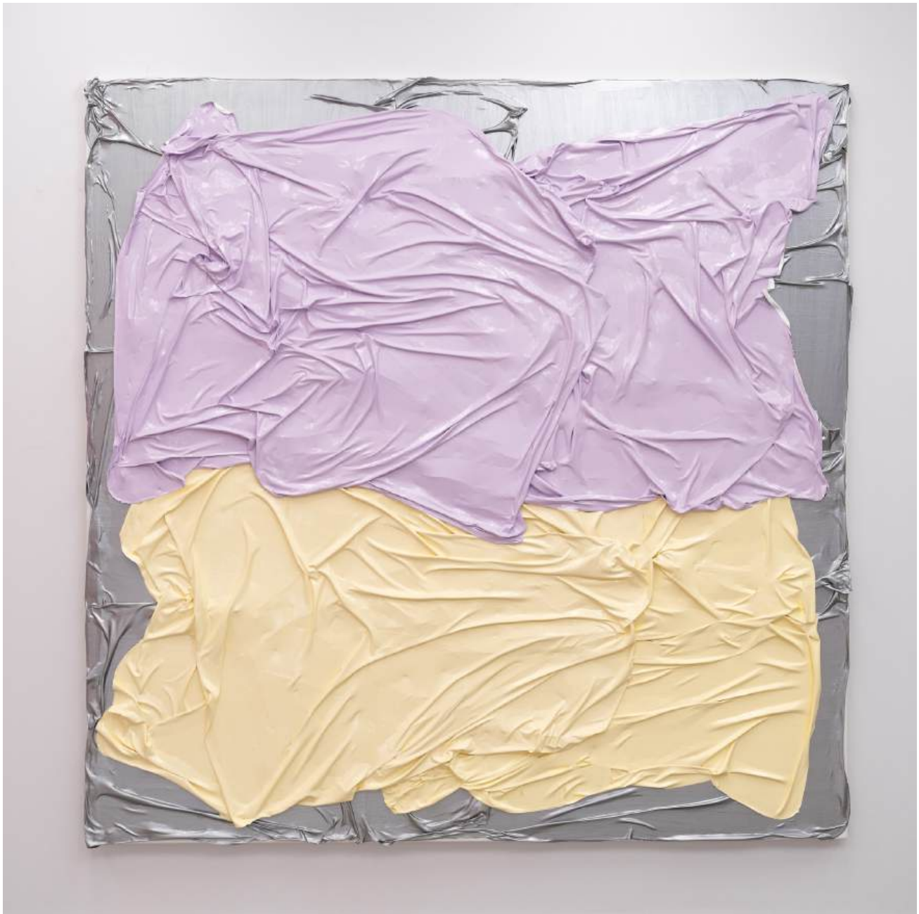
Untitled (SPY) , 2024 acrylic on canvas 183 x 183 cm $22,000 incl. GST