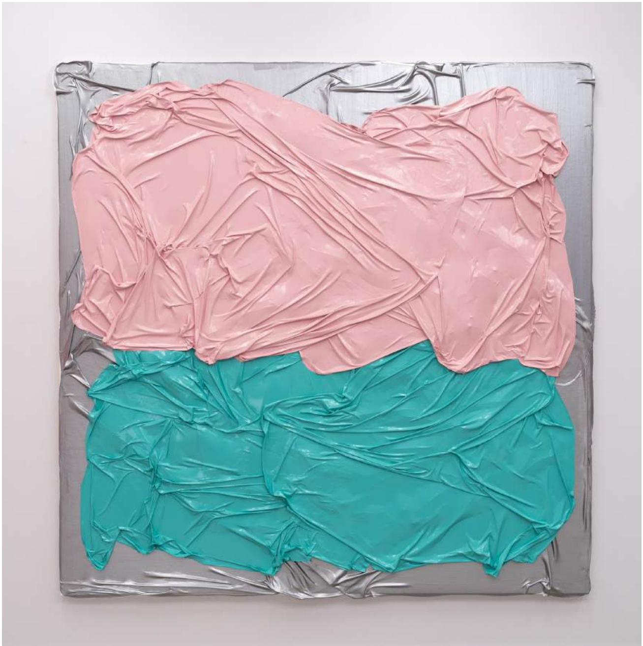
Untitled (SPG), 2024 acrylic on canvas 183 x 183 cm $22,000 incl. GST