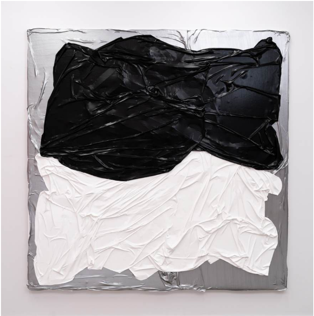
Untitled (SBW) #1, 2024 acrylic on canvas 183 x 183 cm $22,000 incl. GST