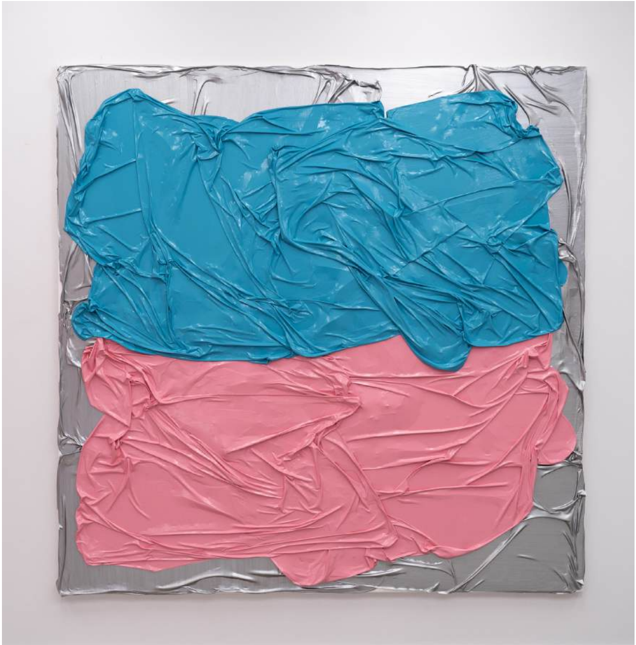
Untitled (SBP), 2024 acrylic on canvas 183 x 183 cm $22,000 incl. GST