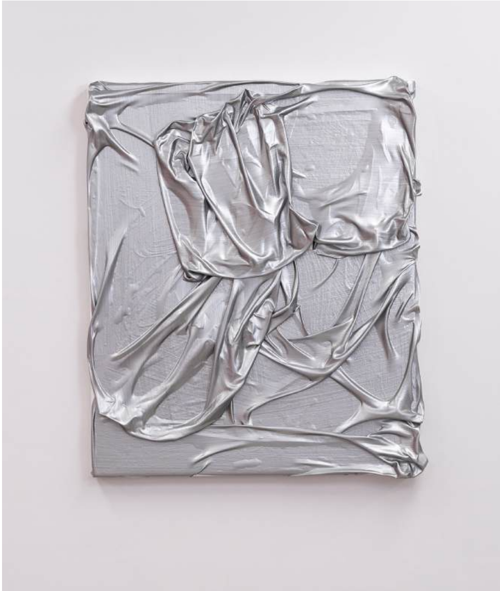
Untitled (Silver) #2, 2024 acrylic on canvas 61 x 51 cm $6,600 incl. GST