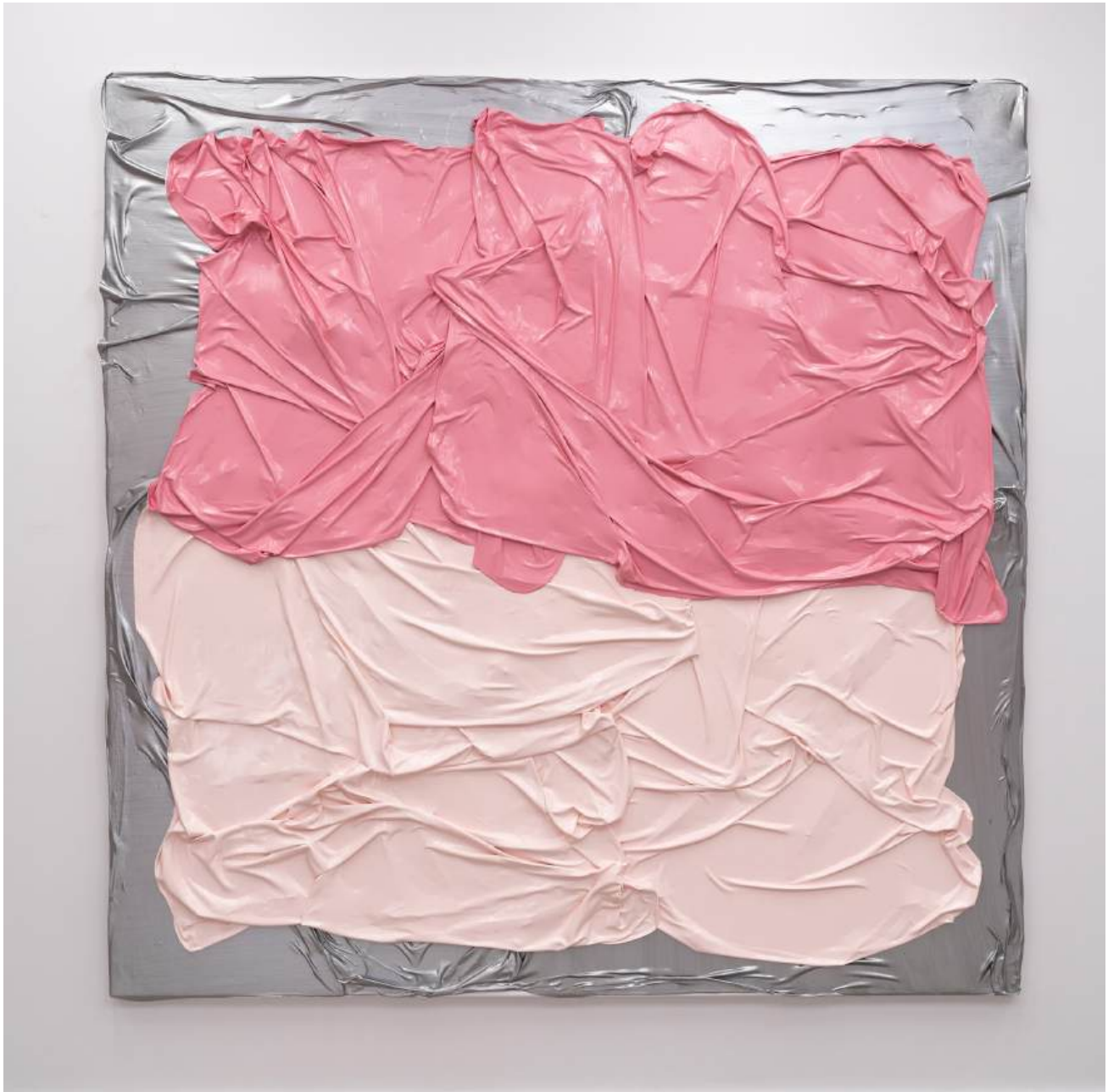
Untitled (SPP) , 2024 acrylic on canvas 183 x 183 cm $22,000 incl. GST