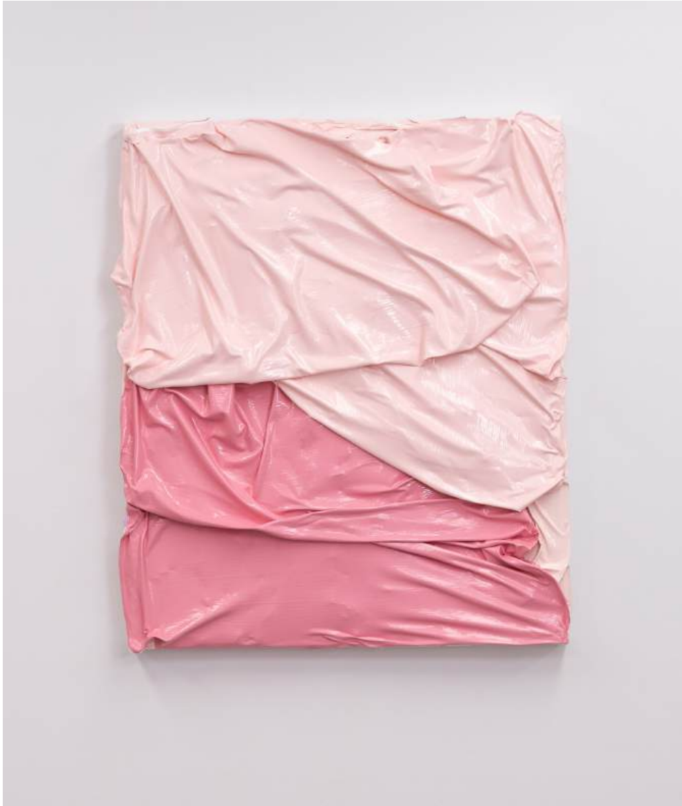
Untitled (PP) #2, 2024 acrylic on canvas 61 x 51 cm $6,600 incl. GST