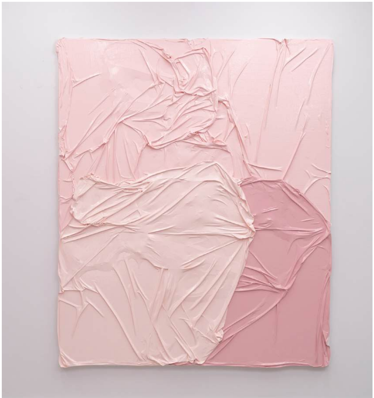
Untitled (PPP) , 2024 acrylic on canvas 183 x 152 cm $20,000 incl. GST