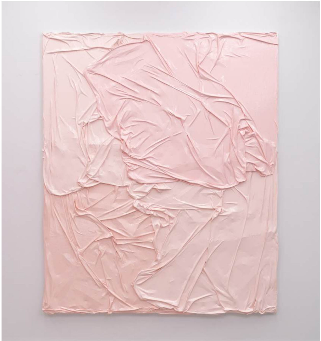
Untitled (PPPP) , 2024 acrylic on canvas 183 x 152 cm $20,000 incl. GST