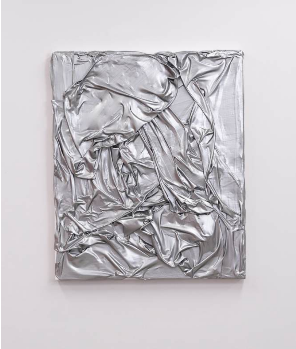
Untitled (Silver) #1, 2024 acrylic on canvas 61 x 51 cm $6,600 incl. GST