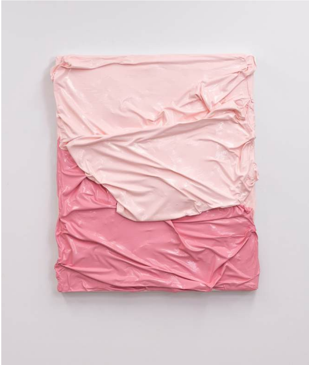
Untitled (PP) #1, 2024 acrylic on canvas 61 x 51 cm $6,600 incl. GST