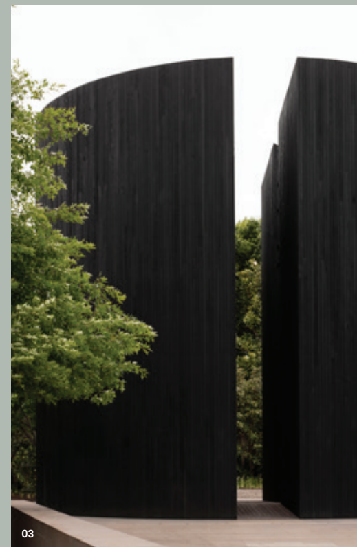
10 BREATHE Paramount House Hotel , 2018