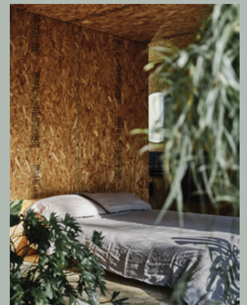
All images ARCHIER Casa Acton Courtesy Archier