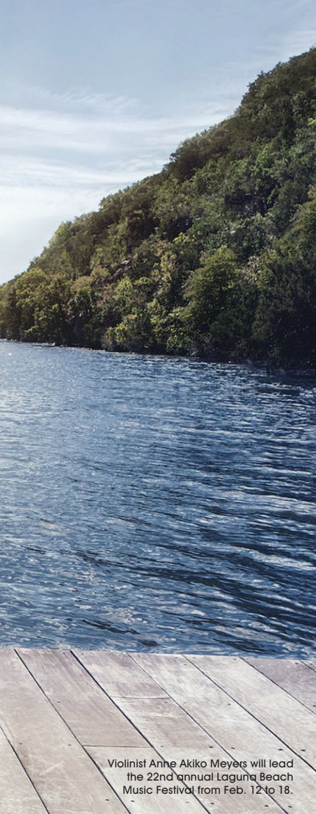
Violinist Anne Akiko Meyers will lead the 22nd annual Laguna Beach Music Festival from Feb. 12 to 18.

the 22nd annual Laguna Beach Music Festival, presented by the Philharmonic Society of Orange County. Artistic director and acclaimed violinist Anne Akiko Meyers will effortlessly lead guest performers in this year's programming at the Laguna Playhouse. Laguna Playhouse, Laguna Beach, philharmonicsociety.org