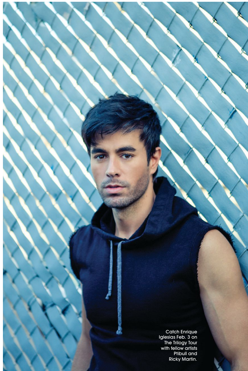
Catch Enrique Iglesias Feb. 3 on The Trilogy Tour with fellow artists Pitbull and Ricky Martin.