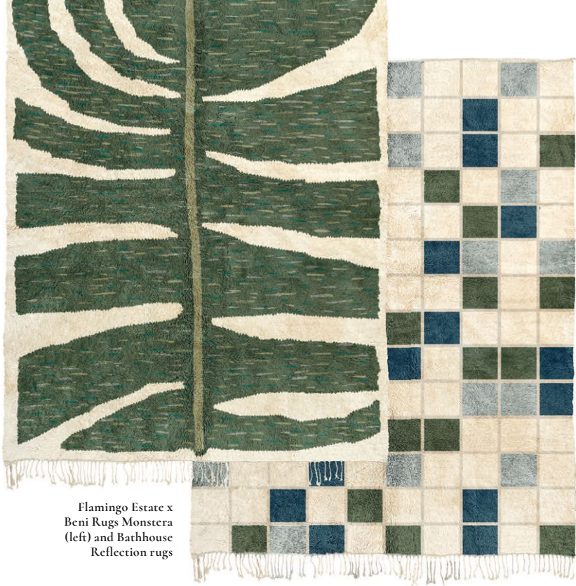
Flamingo Estate x Beni Rugs Monstera (left) and Bathhouse Reflection rugs