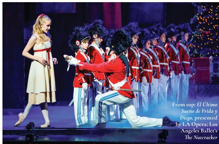
From top: El Último Sueño de Frida y Diego , presented by LA Opera; Los Angeles Ballet's The Nutcracker

A representative journey of Los Angeles and its various complexities, the exhibition Desire, Knowledge, and Hope (with Smog) —a name borrowed from a 1985 multi-panel work by John Baldessari—showcases storytelling through