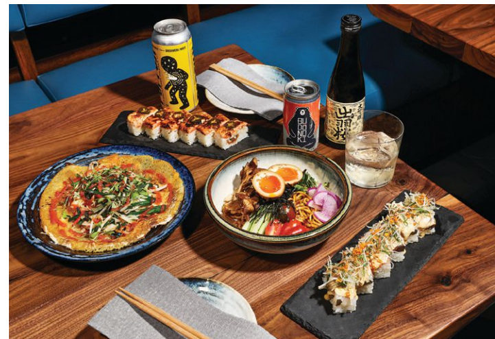
From top: A variety of dishes from Budonoki; the restaurant’s 40-seat dining room features Japanese design accents.