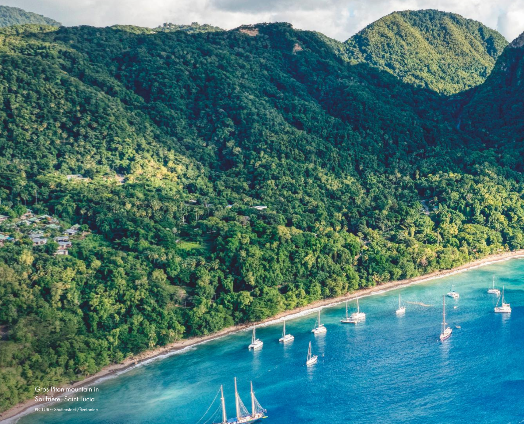
Gros Piton mountain in Soufrière, Saint Lucia